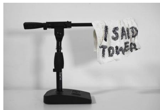
I said a tower, 2023 Ceramic on a MIC stand, 21 x 20 x 16 (cm)