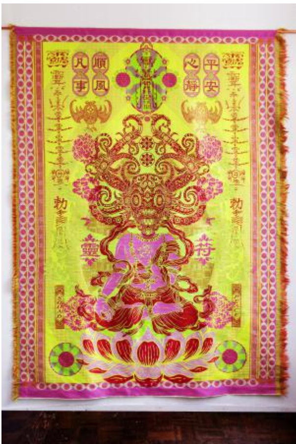
Thread in Loving Mother's Hands, 2023 Industrial Jacquard Weaving , 170 x 225 cm