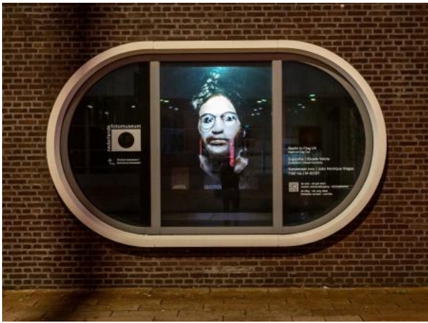
M-Body, 2021 video-installation