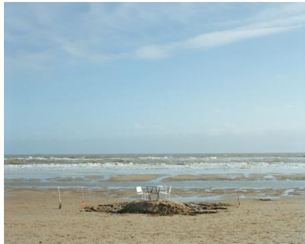
The Act of Gathering for Supper, 2021 Performance Art