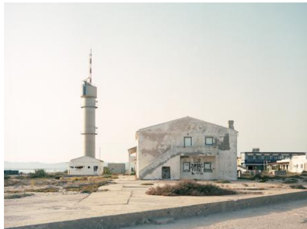
Untitled Series - (Farol Island), 2021 Photography