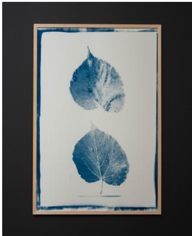
Wat je zait, zul je oogsten, 2023 Cyanotype