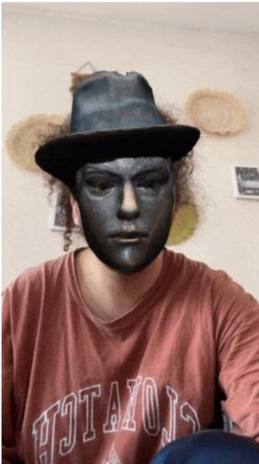
The Ubiquitous Statue of Fernando Pessoa, 2022 Mixed media-installatie