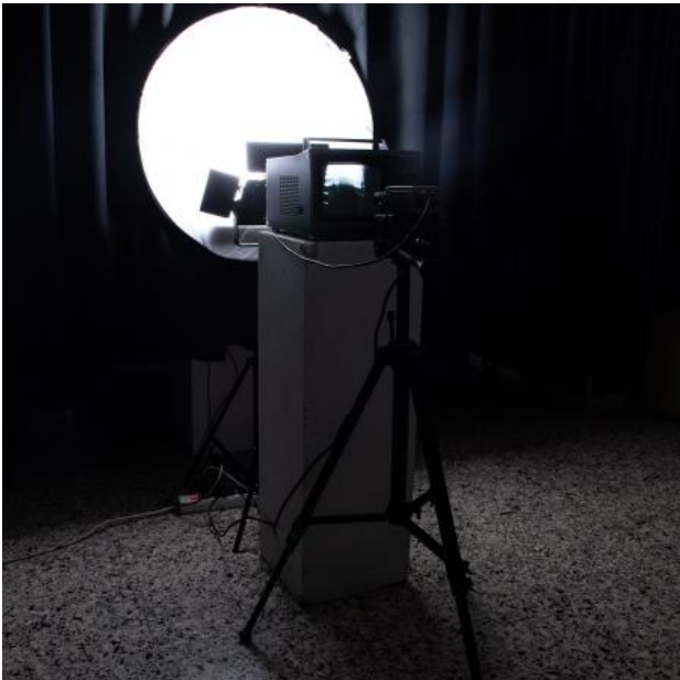
Atalaia, 2019 Mixed media-installatie