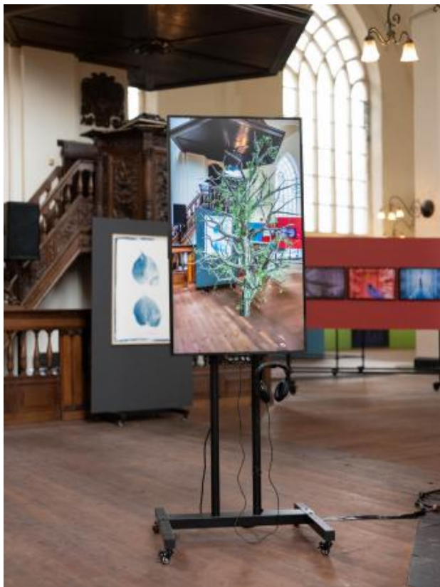
Wat je zait, zul je oogsten, 2023 Mixed media installation

2022 - -- Workshop Instructor at the Royal Academy of Art - The Hague On-going