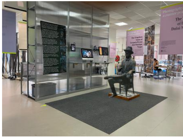
The Ubiquitous Statue of Fernando Pessoa, 2023 Mixed media-installatie