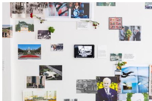
Gestures of Good, 2022

4-colour Riso print, Comcolor print, digital print, magazines, cut-outs from various sources, dried flowers, cut flowers, straw wreaths, greens, 'Danish' cart for flower trading, Fc 588, Fc 577 and Fc 566 water buckets, Moiré wreath ribbon, fringes, TV sc, variable