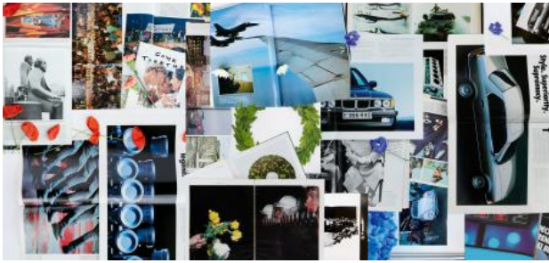
Life in the Post -, 2022 photo collage, digital print, 1782 × 841 mm