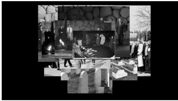
Put Another Wreath, 2022 video loop, variable