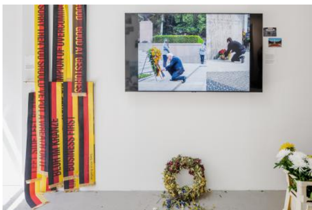
Gestures of Good, 2022

4-colour Riso print, Comcolor print, digital print, magazines, cut-outs from various sources, dried flowers, cut flowers, straw wreaths, greens, 'Danish' cart for flower trading, Fc 588, Fc 577 and Fc 566 water buckets, Moiré wreath ribbon, fringes, TV sc, variable