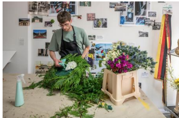
Gestures of Good, 2022

4-colour Riso print, Comcolor print, digital print, magazines, cut-outs from various sources, dried flowers, cut flowers, straw wreaths, greens, 'Danish' cart for flower trading, Fc 588, Fc 577 and Fc 566 water buckets, Moiré wreath ribbon, fringes, TV sc, variable