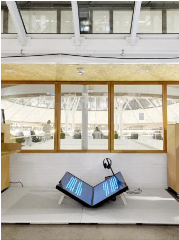
The World We Enter, 2021 2-channel video, variable, 9:55 min