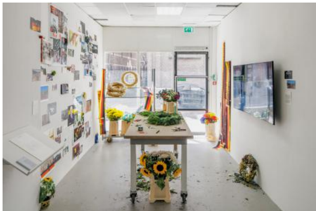
Gestures of Good, 2022

represented typographically and grouped in three main themes at the bottom of the basin. They refer to the states of Panama, Liberia and the Marshall Islands, some of the main providers of ship registries (more than 39% in terms of worldwide carrying capacity), which has different individual implications for these states and reflects local histories of conflict. Their flag colours are visualised on the water surface but blend into an oily carpet over time.