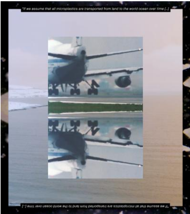
The World We Enter, 2021 2-channel video, variable, 9:55 min