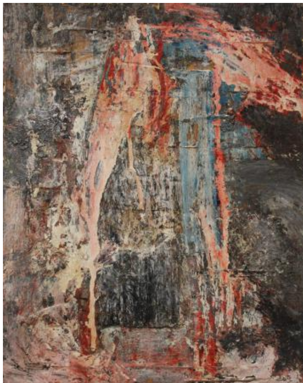
Fevr I, 2022 Paint, cardboard, cello tape, 30 x 40 cm