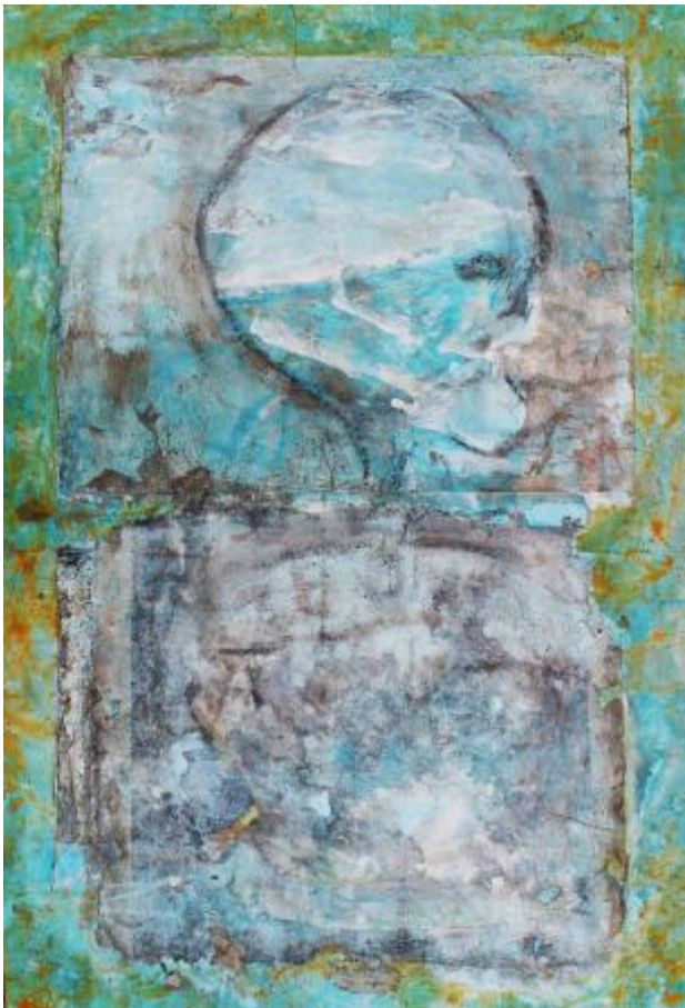
Sleep (insomnia), 2024 Paper, banana leaf paper, paint, glue, coffee, turmeric, 55 cm x 75 cm