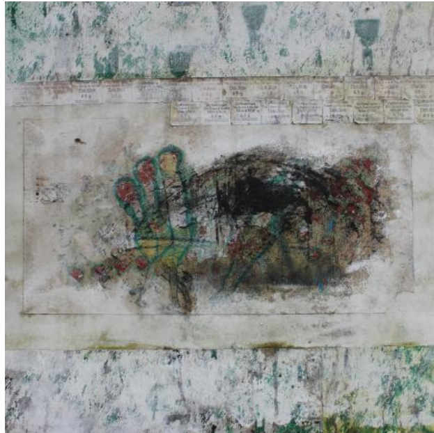
Thai Stick The Hague, 2024 Cardboard, stickers, paint, ink, pencil, 55 cm x 55 cm