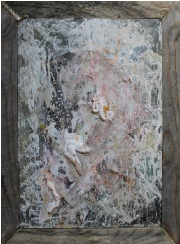
Amalia 1, 2025 Mixed media, 25 x 35 cm