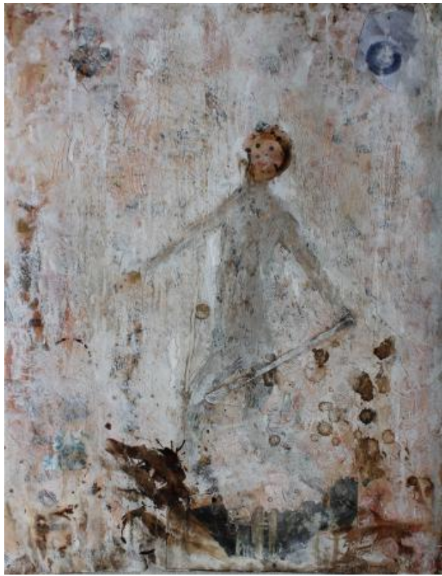
Tear gas, 2024 Paper, paint, paper, coffee, 60 cm x 45 cm