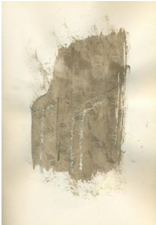
Chair, 2024 Paper, coffee, pencil, knife, 30 cm x 21 cm