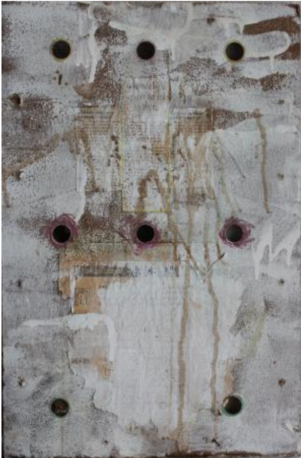
Fruit crate bottom, 2024 Wooden board, newspaper clippings, coffee, paint, 44 cm x 29 cm