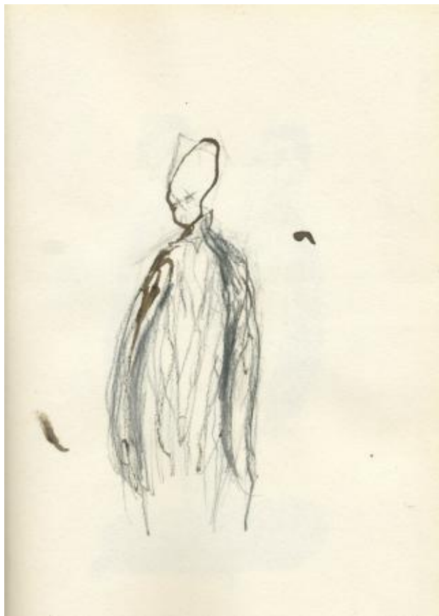
Bruslike, 2024 Paper, pencil, coffee, 30 cm x 21 cm