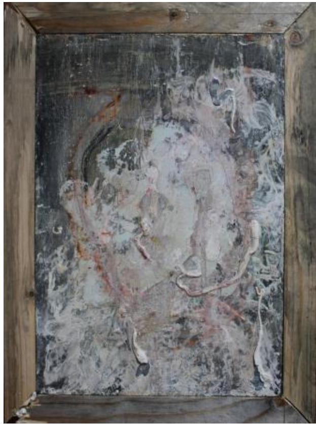
Amalia 2, 2025 Mixed media, 25 x 35 cm