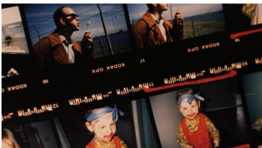
Insomnia, 2026 Film, 64 min.