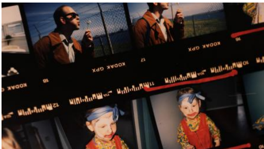
Insomnia, 2026 Film, 64 min.