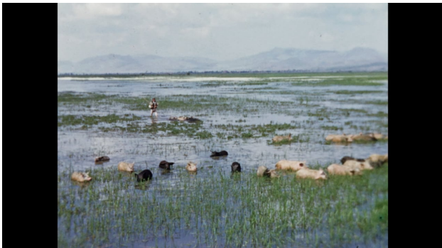
Lake Bottom Cinema (teaser), 2023 01:32