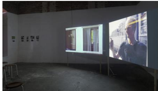
The Failed Holiday - marathon, 2024 Video-installation, 18 min.