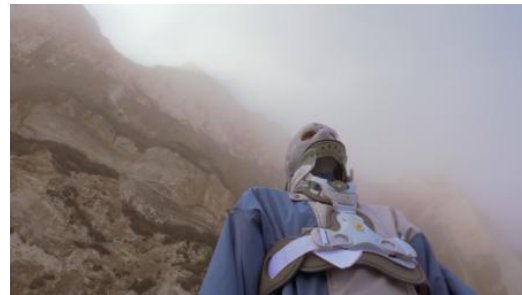
Insomnia, 2026 Film, 64 min.