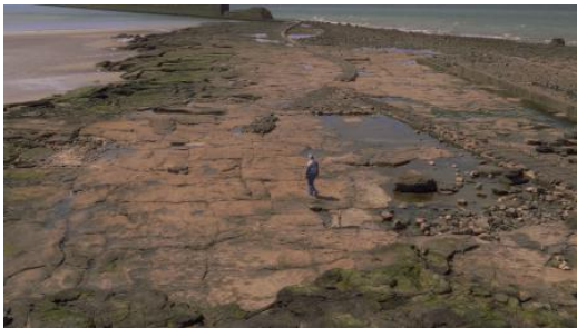
Insomnia, 2026 Film, 64 min.