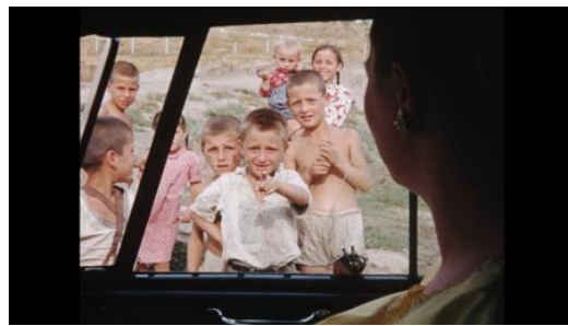
Lake Bottom Cinema, 2023 Film, 25 min.