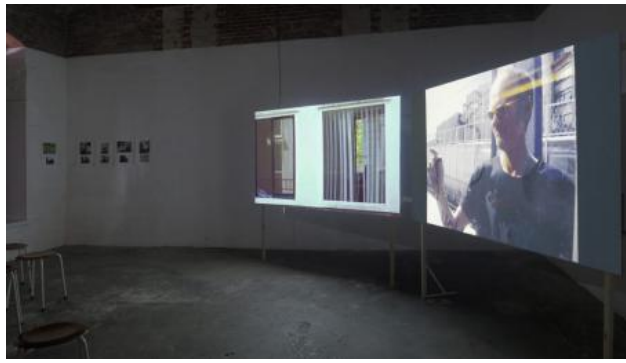
The Failed Holiday - marathon, 2024 Video-installation, 18 min.