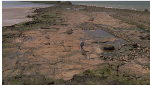
Insomnia, 2026 Film, 64 min.

2019 Cultuurstimuleringsfonds Gemeente Haarlem Haarlem, Netherlands Stipend