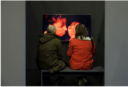
(un)scripted, 2024 Film, 16 min.