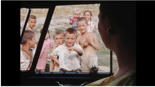
Lake Bottom Cinema, 2023 Film, 25 min.