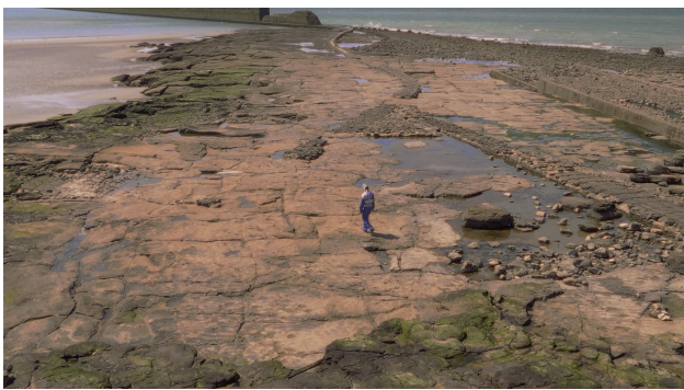
Insomnia (trailer), 2026 01:32