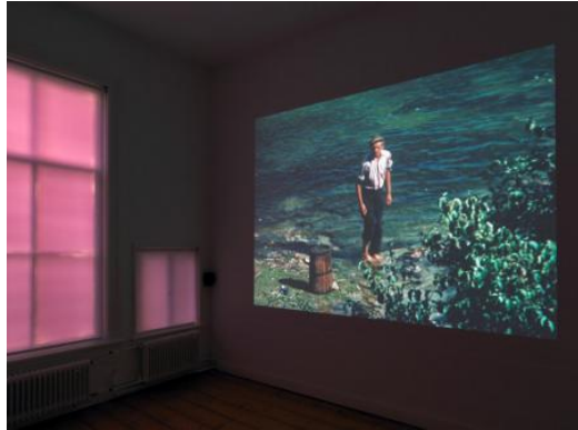
Lake Bottom Cinema, 2023 Film, 25 min.