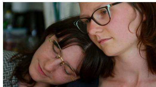
Insomnia, 2026 Film, 64 min.