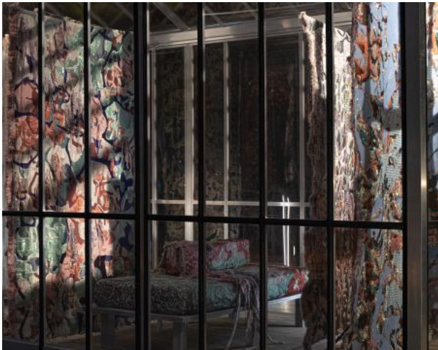
Collectie Stimuli Wiring System, 2021 Weven, spinnen, twijnen