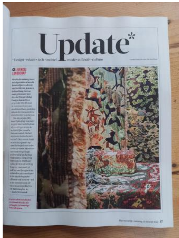
FD Persoonlijk, 2022