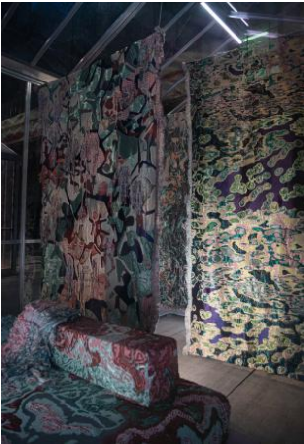
Collectie Stimuli Wiring System, 2021 Weven, spinnen, twijnen