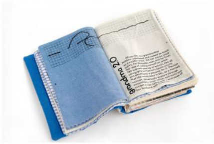
A Textile Room Screen printed patchwork fabric book, 100 pages 30 x 18 x 8 cm, 2022