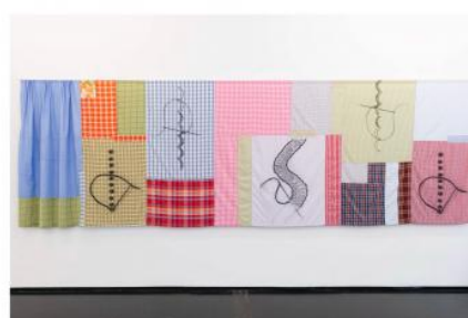
Hobby Act Screen printed patchwork curtain, 1.00 x 3.00 m. Exhibition view, 2022, DuPT, NL, 2024