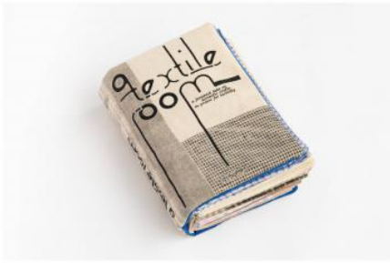
A Textile Room Screen printed patchwork fabric book, 100 pages 30 x 18 x 8 cm, 2022