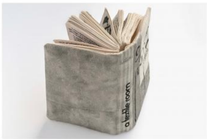
A Textile Room Fabric book, 30 x 18 x 8 cm, 100 pages, 2022