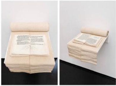
A Textile Room Fabric book Exhibition view of 2020 ENP, PL, 2024