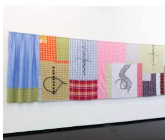
Hobby Act Screen printed patchwork curtain, 1.00 x 3.00 m. Exhibition view, 2022, DuPT, NL, 2024 'Hobby Act' is a large site-specific curtain with screen prints on patchwork fabrics that borrow photographs from old sewing handbooks, to bring focus on these delicate and repetitive gestures. Printed on classical checkered fabrics that remind of domestic toolkits, these seemingly effortless images with a royal green create a contrast with the meticulousness of sewing. The curtain explores skills in light and color, using patchwork techniques as a metaphor for mending and building narratives. It pays tribute to these hobby activities – crafts between work and leisure, made to keep the hands busy and the mind free.