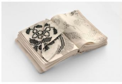
A Textile Room Fabric book, 30 x 18 x 8 cm, 100 pages, 2022