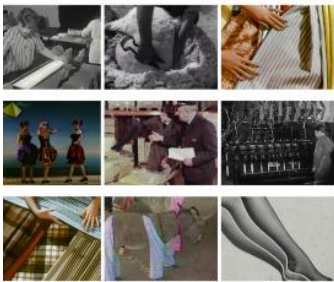
Textile Wonderland Film, edited by Jonathan Wadsworth and produced by Timothy Studios, 1970, 2024 Archive film material passed on a dynamic soundscape shows behind the scenes of textile production on a world scale, stepping out from the domestic and crafty setting to an industrial dimension. "Textile Wonderland" is a video that introduced Ariane Tournant's solo exhibition at Galerie Workshop (The Hague, NL), providing a sensory context for the works on show.