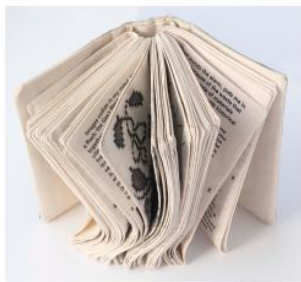
A Textile Room Screen printed fabric book, hand-bound, 100 pages, edition of 5, graphic design by Deborah Davidson, 2022 "A Textile Room" is a technical challenge, a screen printed fabric book of more than a hundred pages, containing an essay written by the artist during her residency at Buchanan Arts, QLD, in the spring 2023. Drawing on feminist readings and critical theory, the object transforms the practice of reading into a tactile experience. The practices of sewing and darning - putting things together, repairing fragments to create meaning - come together in a multi-layered object, at once dense and soft, materializing in its manufacture the slow sewing practices that are its subject.