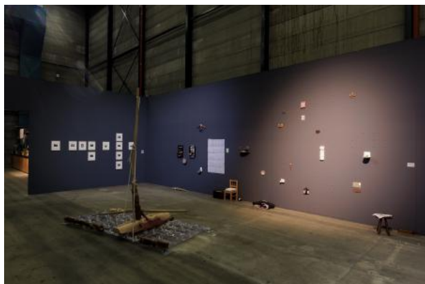
Prospects Art Rotterdam, 2024 installation

2022 - Gyrotonic Apprentice teaching On-going