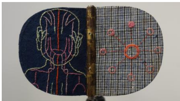
The rest of it is stillness, 2022 embroidery, textile, copper, circuit board and mechanics, 13 x 8 x 35