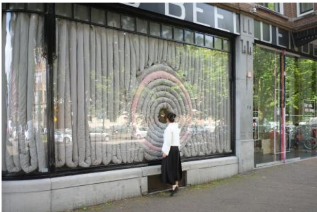
The rest of it is stillness, 2022 textile, patchwork, starch stuffing, 587 x 20 x 131