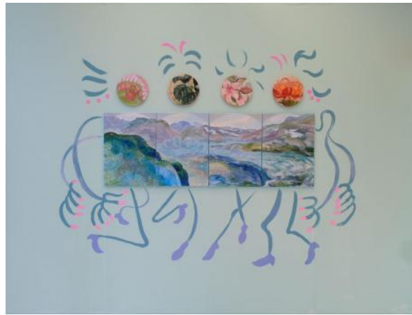
Landscape from our ancestress , 2023 Oil on canvas, 70 x 200 cm