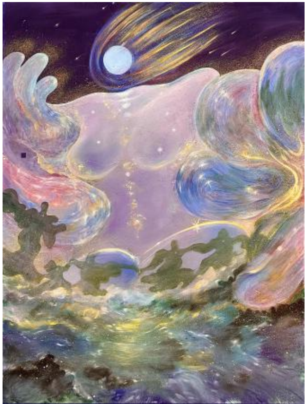
Battle Ground, 2023 Oil, acrylic on canvas, 160 x 120 cm