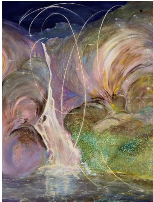
Battle Ground, 2023 Oil, acrylic on canvas, 160 x 120 cm