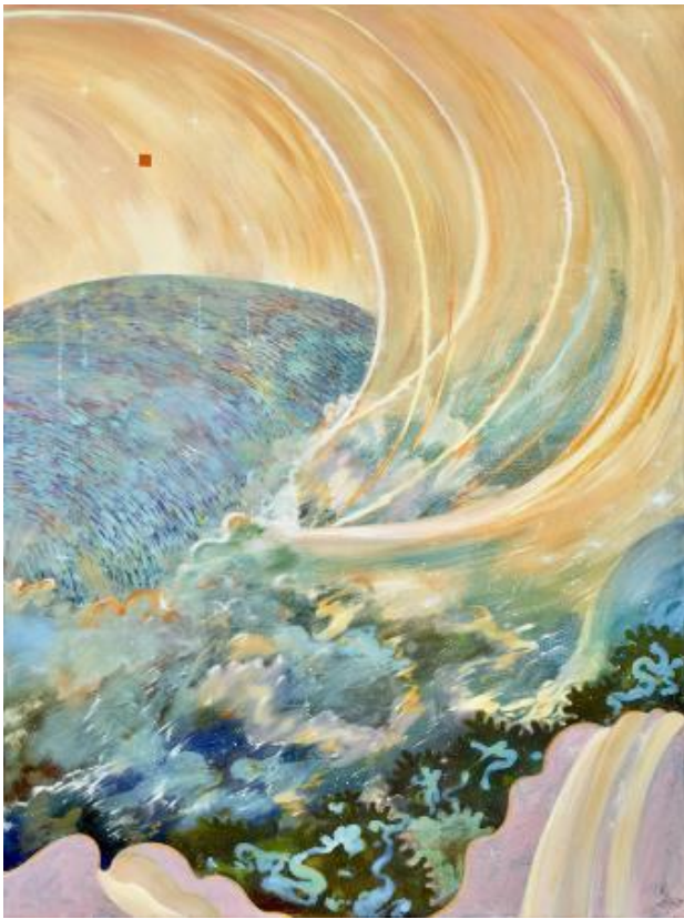
Battle Ground, 2023 Oil, acrylic on canvas, 160 x 120 cm