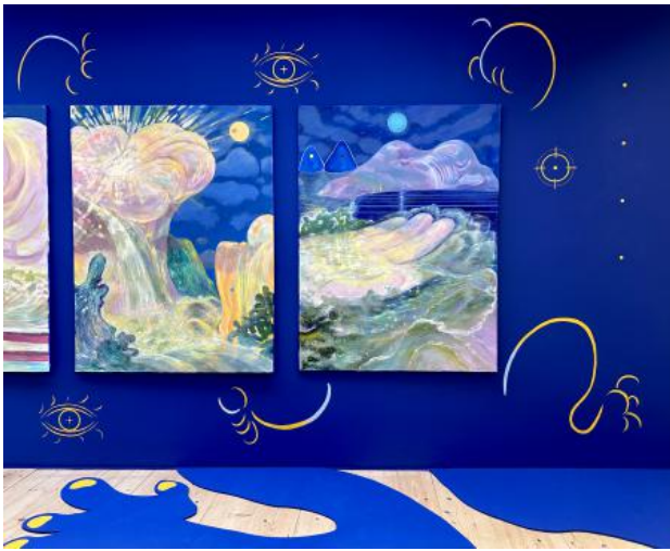
Battle Ground, 2024 Oil, acrylic on canvas, 160 x 120 cm