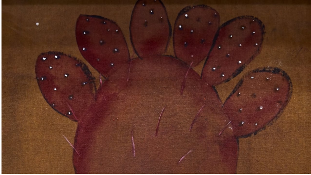
The cosmic race , 2022 5minuites 32seconds