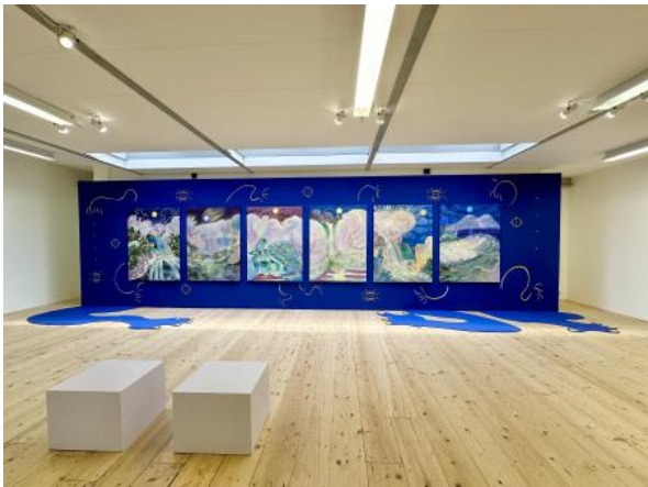
Battle ground series, 2024 Oil, acrylic on canvas, 160 x 120 cm, 6pieces