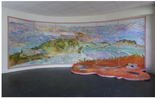
Welcome to the Buffer Zone, 2022 Oil, acrylic on canvas, pannel, Nitrile rubber, objet, sound, video 05:32, 350 x 1000 x 150 cm