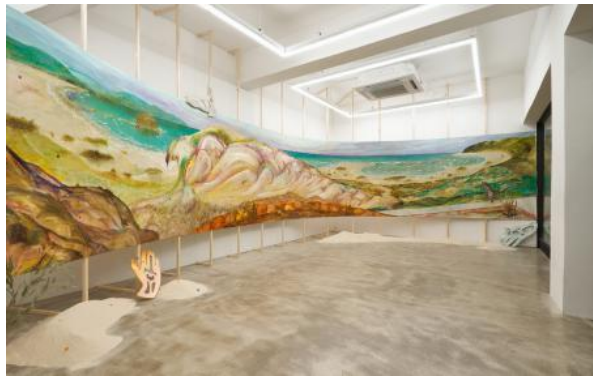
Buffer Zone, 2021 Oil, acrylic on canvas, 157×955.5cm