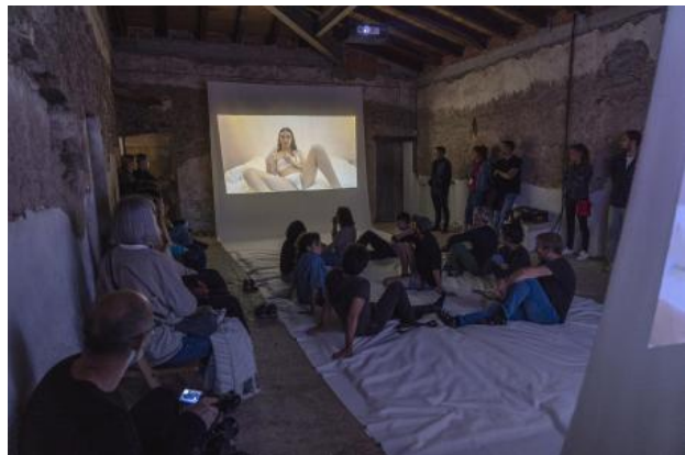
A two way at la Bianyal, 2023 video installation, 3x20m