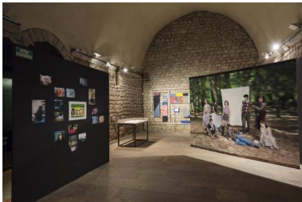
Outside is scary and inside is lonely, we need a third place, 2022 Photography exhibition, 2,25m x 3m