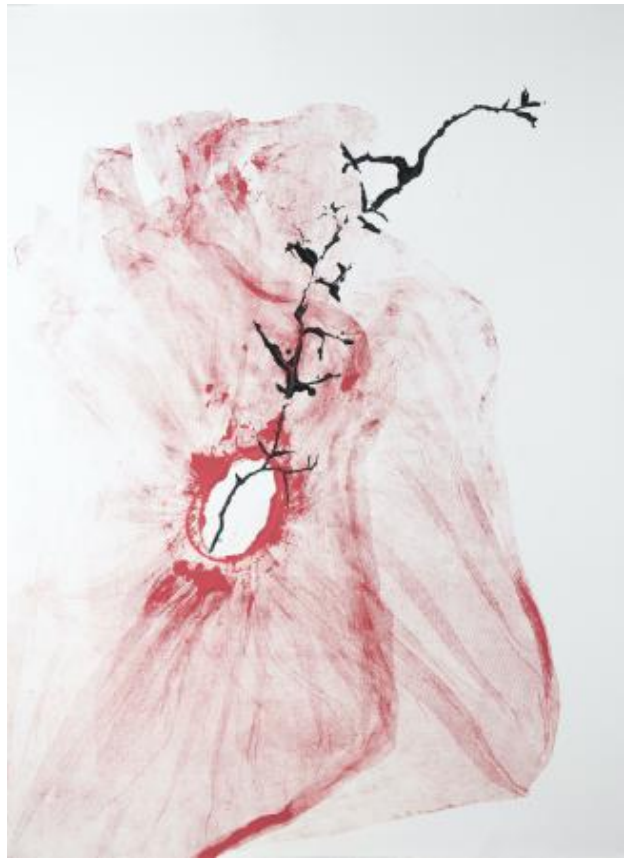
Growing Pains III, 2021 Monoprint, 107x78 cm