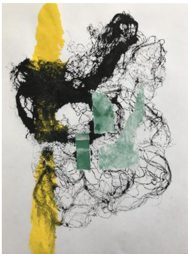
Echoes of Co-existence, 2021 Analogue Objects Print (Mono-prints), 30x40 cm