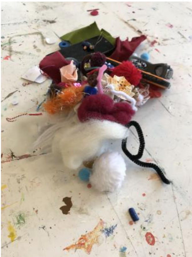
Untitled XVII, 2020 Digital Photography, 29.7 x 42.0 cm