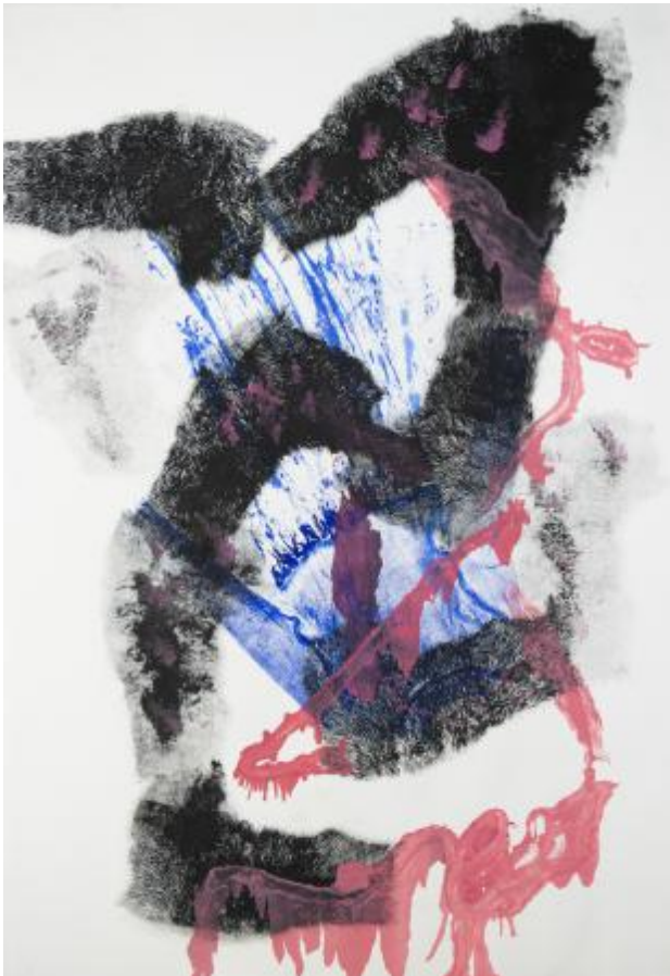
Growing Pains I, 2021 MonoPrint, 112x76 cm