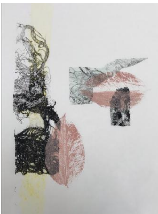
Echoes of Co-existence, 2021 Analogue Objects Print (Mono-prints), 30x40 cm