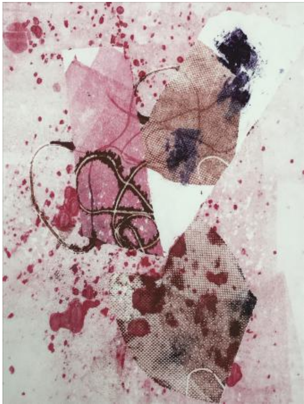
Echoes of Co-existence, 2021 Analogue Objects Print (Mono-prints), 30x40 cm