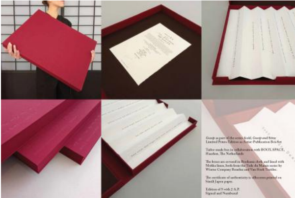
Gossip as part of the series Scold, Gossip and Siren, 2023