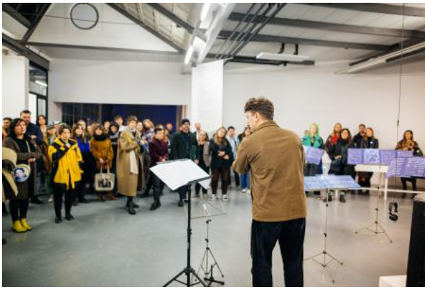
Siren, as part of Scold, Gossip and Siren, 2023