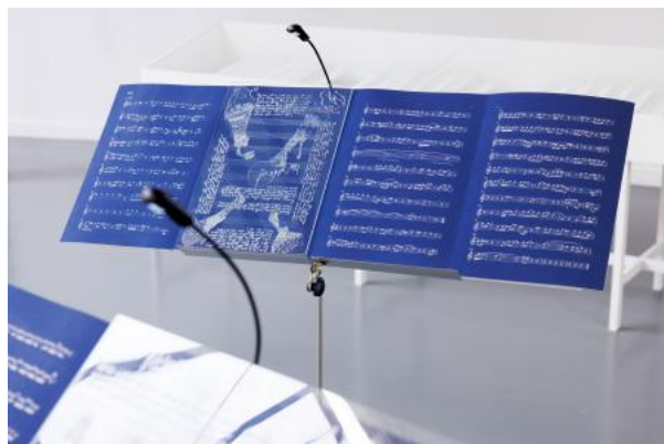
Siren, as part of Scold, Gossip and Siren, 2023