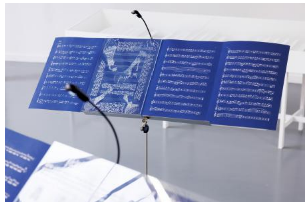
Siren, as part of Scold, Gossip and Siren, 2023