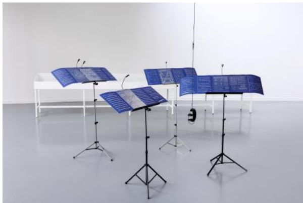
Siren, as part of Scold, Gossip and Siren, 2023