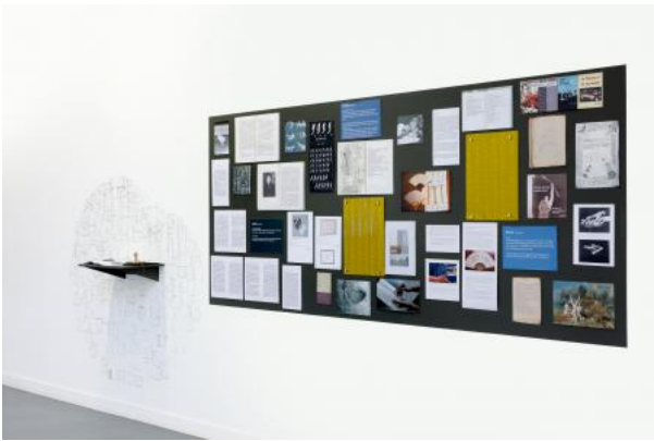
Scold, Gossip and Siren, 2023