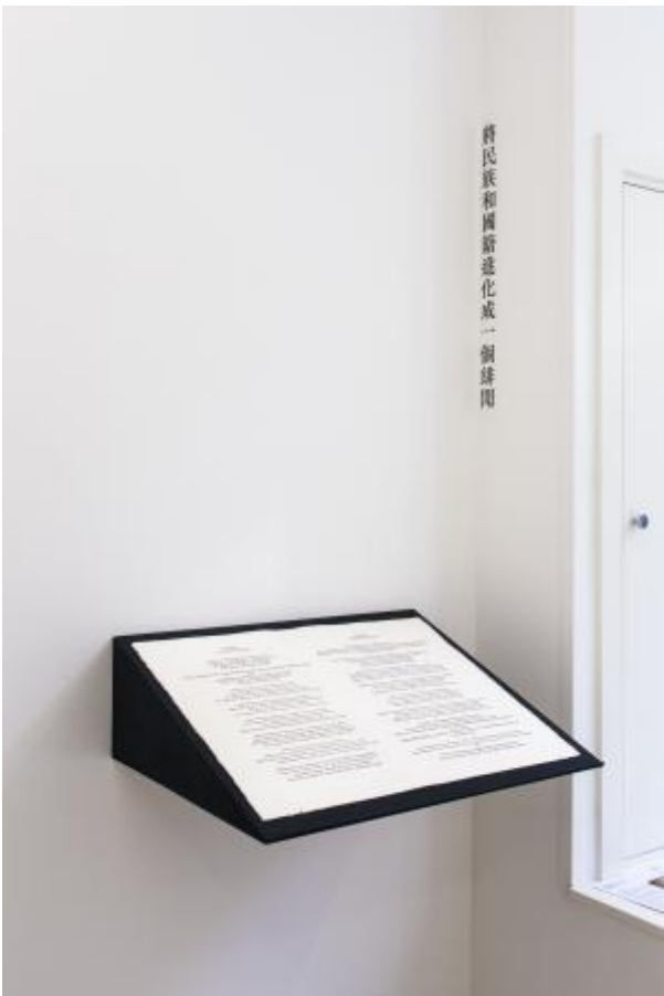
What Kinds Of Times Are These, When To Talk About Trees Is Almost A Crime, 2023