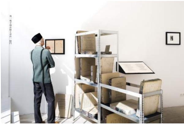
What Kinds Of Times Are These, When To Talk About Trees Is Almost A Crime, 2023