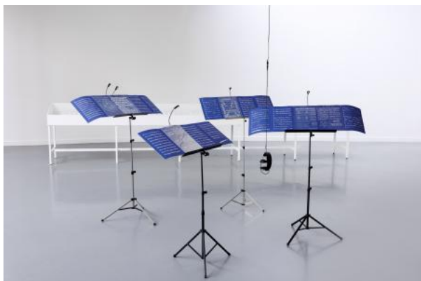
Siren, as part of Scold, Gossip and Siren, 2023