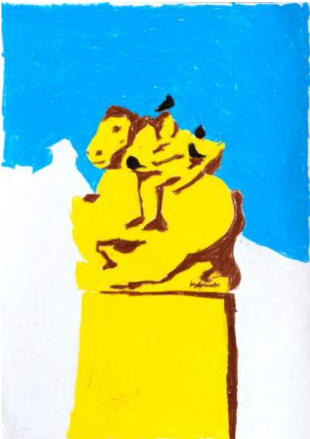
Oh Oh Den Haag, 2024 Wax Crayon on paper, 21 x 29.7 cm