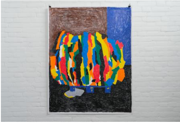
Untitled, 2024 Wax Crayon on paper, 100 x 135 cm