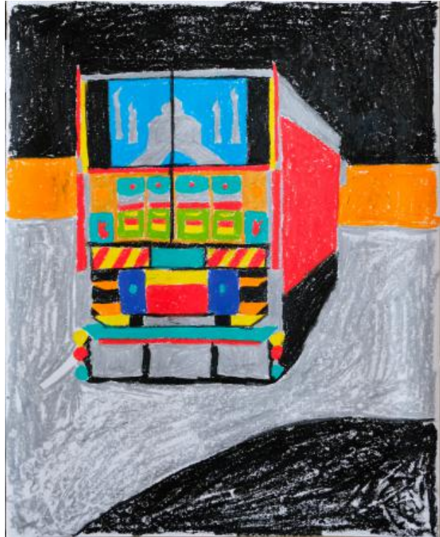
Torno, 2024 Wax Crayon on paper, 56 x 75 cm