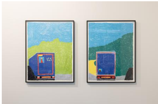
Vormumise Eeldused - Preconditions for Formation at Rüki galerii, 2024 Wax Crayon on Paper