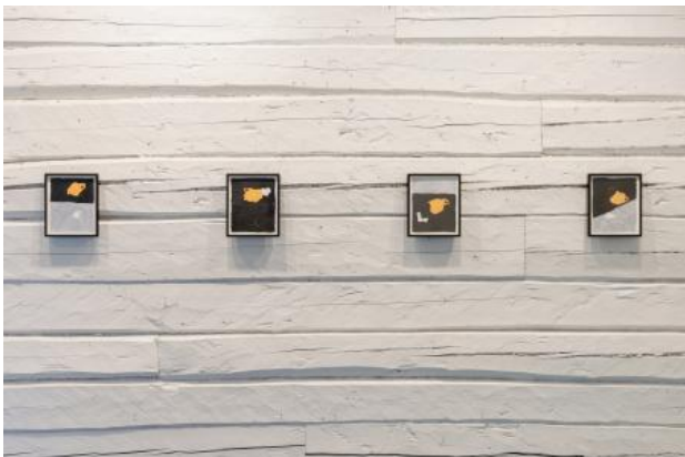
Vormumise Eeldused - Preconditions for Formation at Rüki galerii, 2024 Wax Crayon on Paper