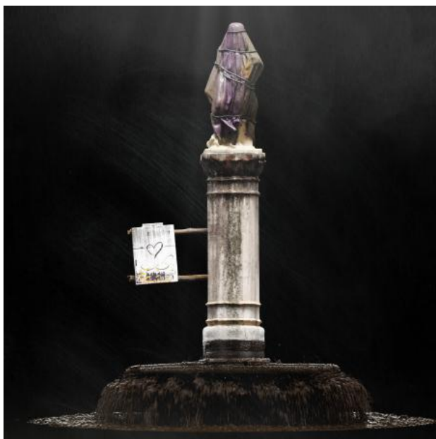
SELO, 2025 Game Engine, Live Simulation