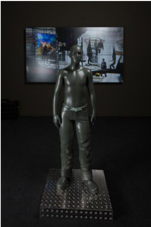
SELO, 2025 Game Engine, Live Simulation