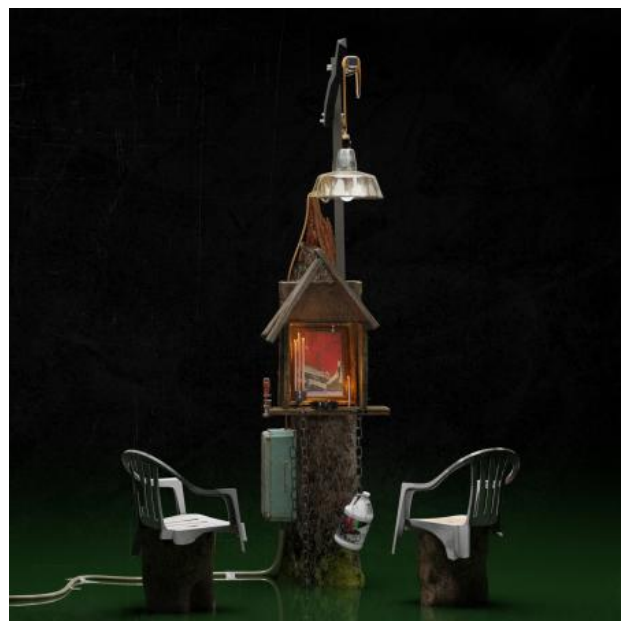
SELO, 2025 Game Engine, Live Simulation