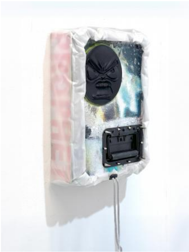
Prophet, 2024 Mixed Media, 40x25x15