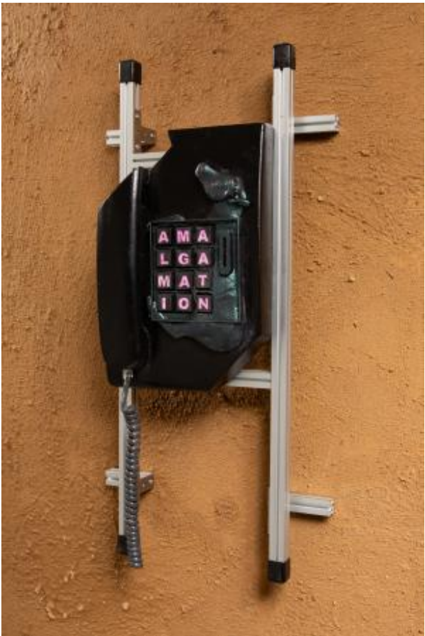
amalgamation, 2024 Mixed Media , 220x70x35