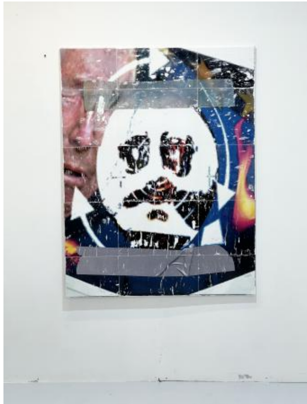
induced compliance , 2024