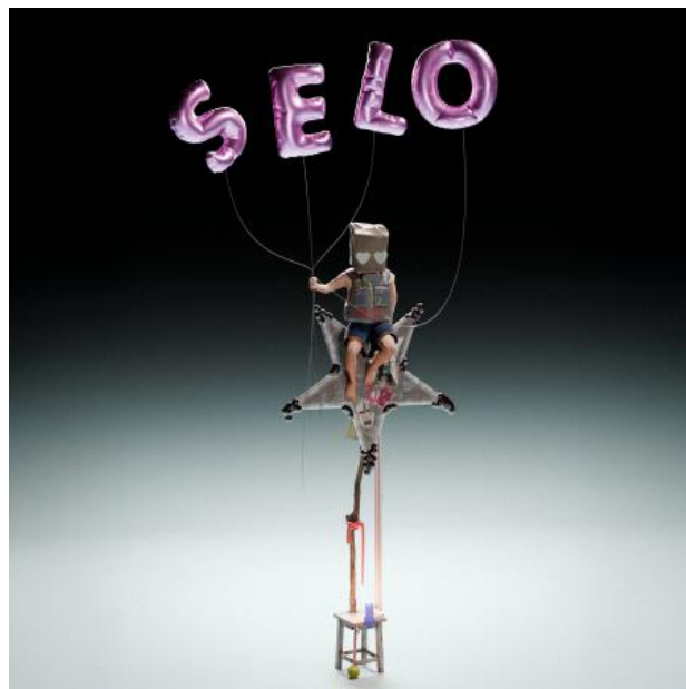
SELO, 2025 Game Engine, Live Simulation