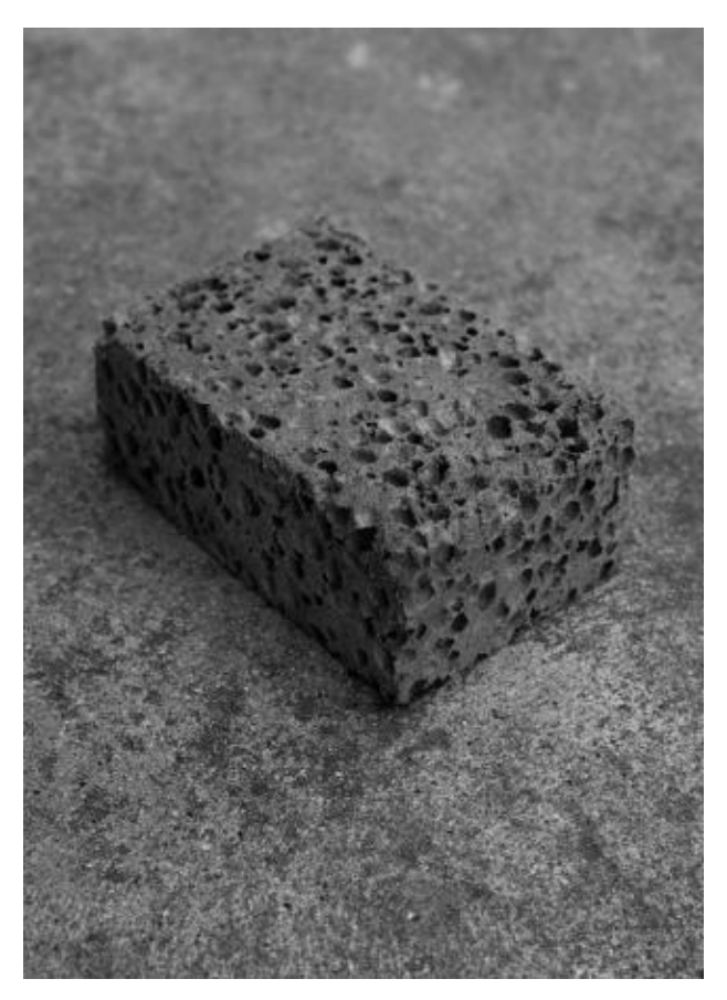
She is the canary in the coalmine of a dying empire, 2020 Photography