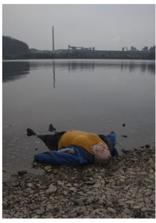
She is the canary in the coalmine of a dying empire, 2020 Photography