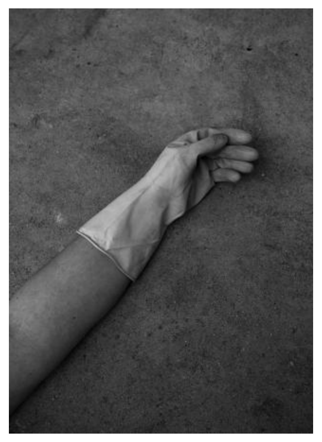
She is the canary in the coalmine of a dying empire, 2020 Photography

2021 - -- Workshop for the municipal archives in The Hague On-going