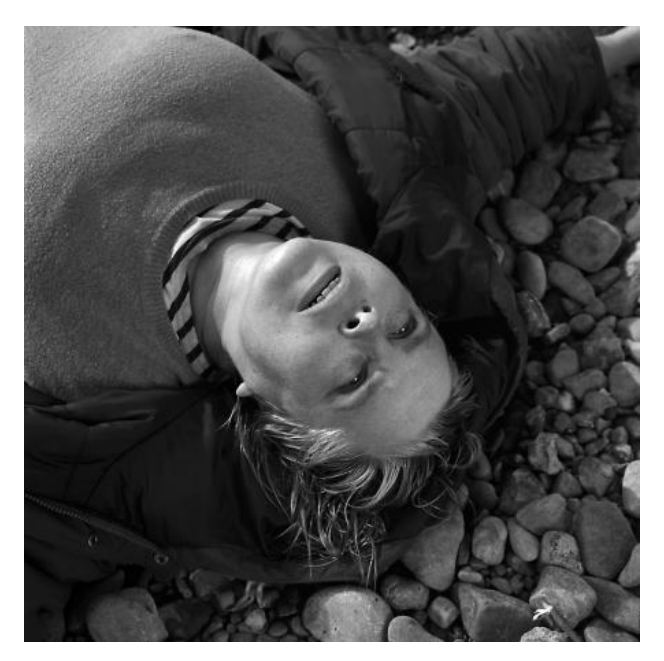
She is the canary in the coalmine of a dying empire, 2020 Photography