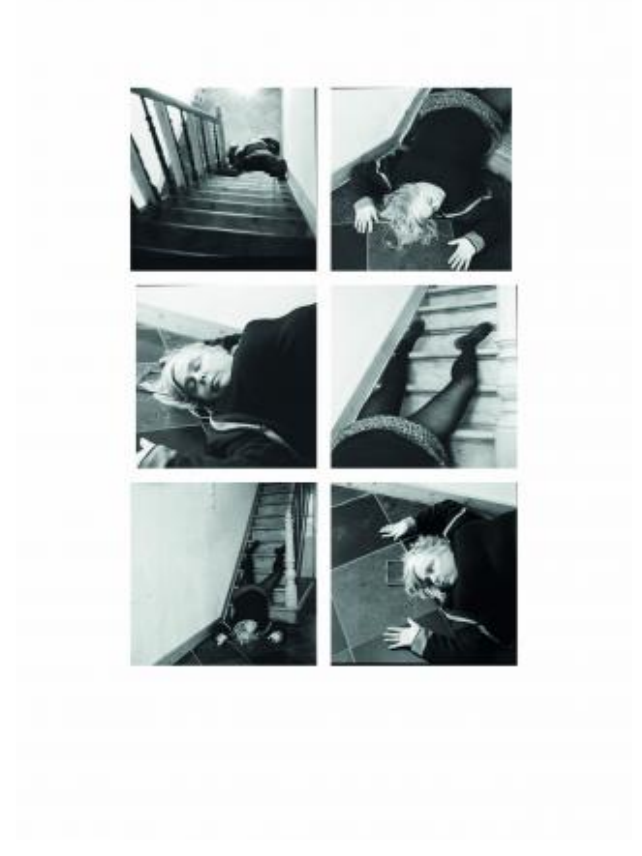
She is the canary in the coalmine of a dying empire, 2020 Photography