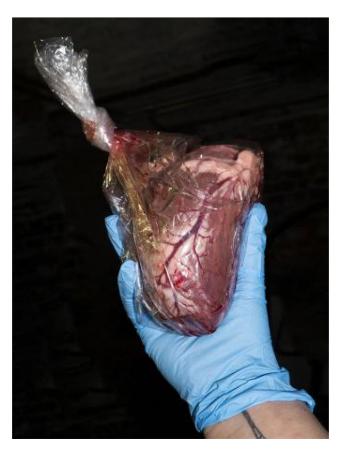
She is the canary in the coalmine of a dying empire, 2020 Photography