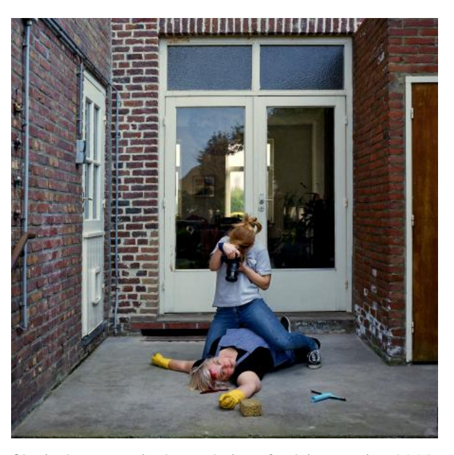
She is the canary in the coalmine of a dying empire, 2020 Photography