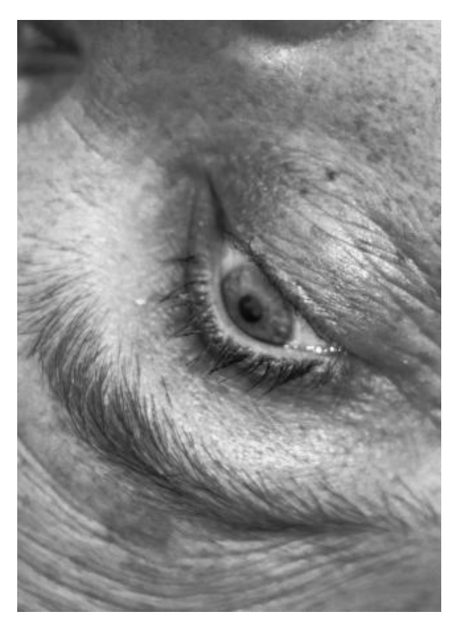
She is the canary in the coalmine of a dying empire, 2020 Photography