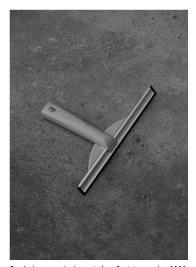
She is the canary in the coalmine of a dying empire, 2020 Photography