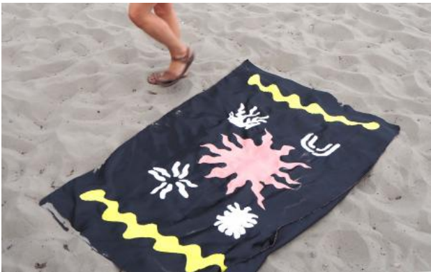
Pinecone, Party, Loss, and Fire , 2022 Textiles, 200 x 120