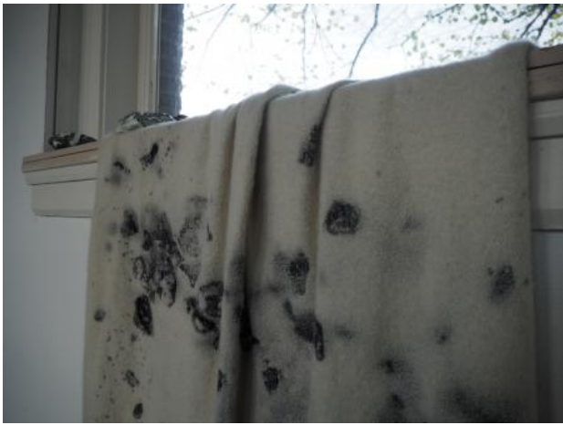
Forgotten Artworks, 2023 jacquard weaving