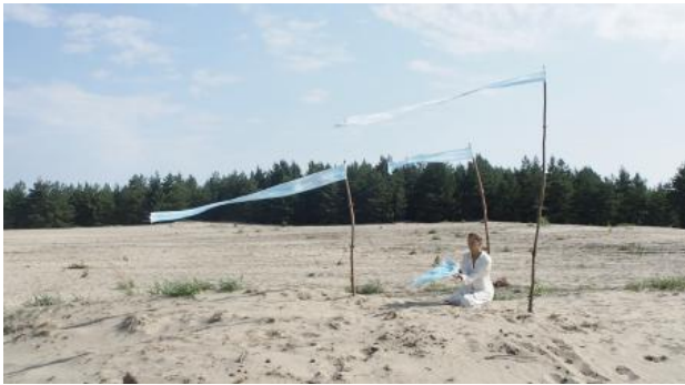
In-tent-gible, 2022 Video, installation, performance