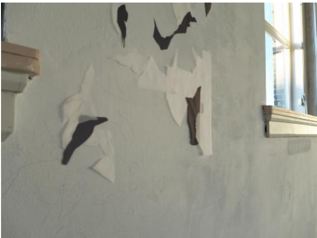
Sojourn, 2022 Paper, light-reflective fabric, pencil on the wall, 220 x 150