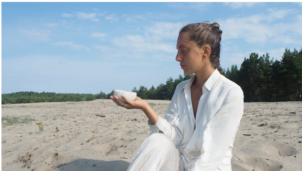
InTentGible, 2022 00:24