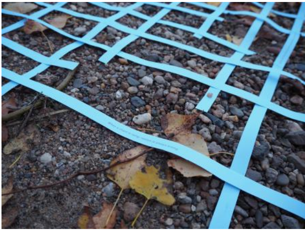
Dreams of the River, day 1, 2022 Text, paper, temporary installation