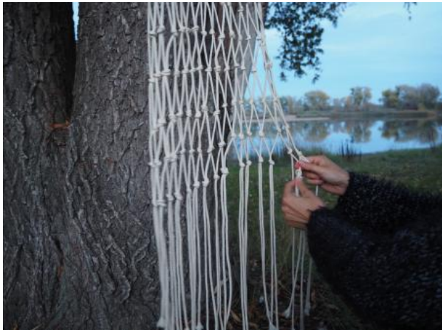
Dreams of the River, day 2, 2022 Performance, textiles knotting