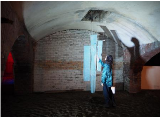
In-Tent-Gible, 2022 textile, video