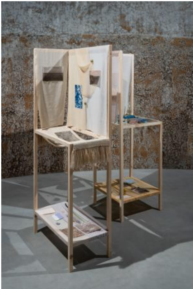
Cattails and Paper Mountains, 2023 textile, photography, installation , various dimensions