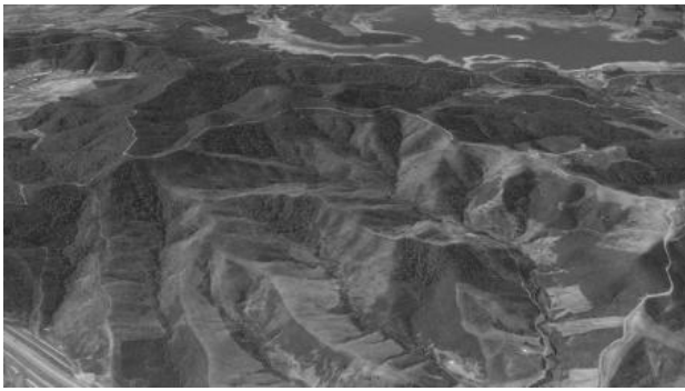
From the Ashes, 2023