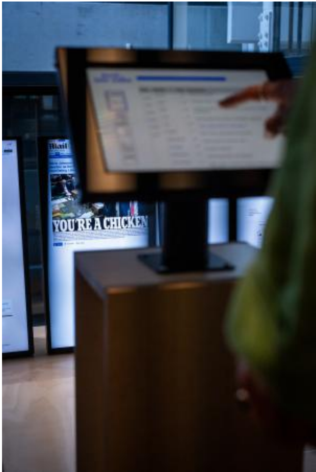
Brexit News Archive, 2022