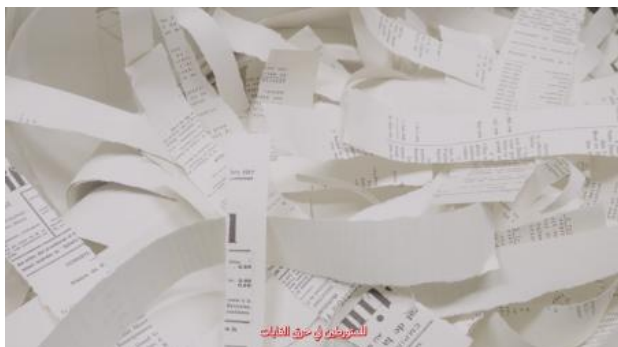
From the Ashes, 2023