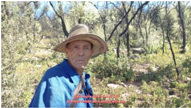
From the Ashes, 2023