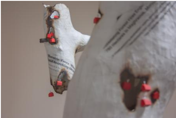
From the Ashes, 2023