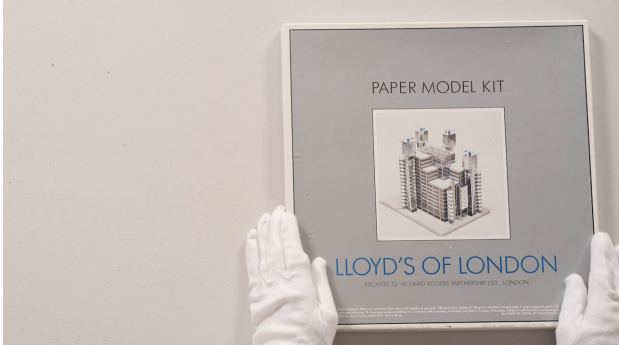
Thy Cities Shall With Commerce Shine--Part I, 2021