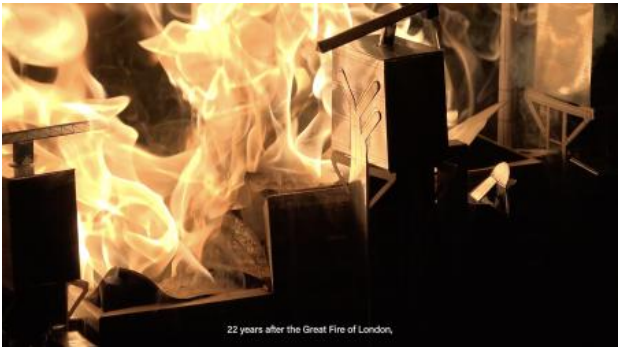
Thy Cities Shall With Commerce Shine - Part I, 2021