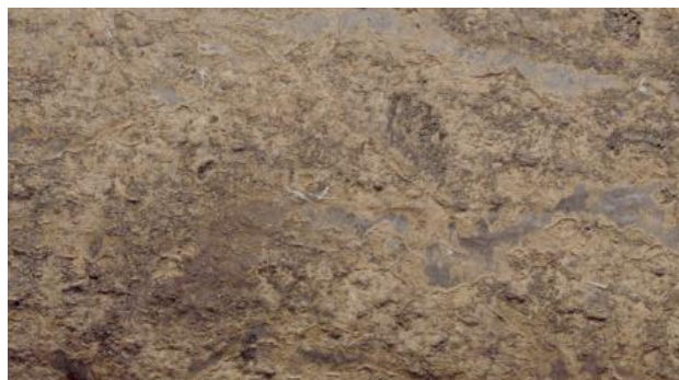
From the Ashes, 2023