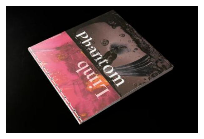
PHATOMPAIN, 2022 CMYK printing