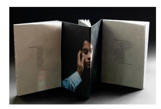
ABSENCE, 2022 CMYK printing