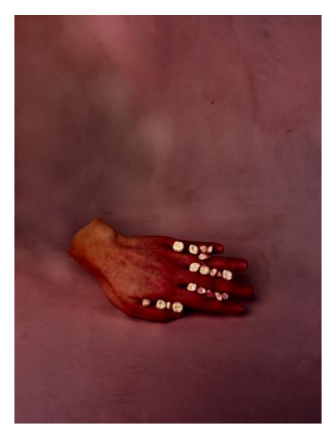
Nice Meating You, 2022 Giclee print, 75 x100cm