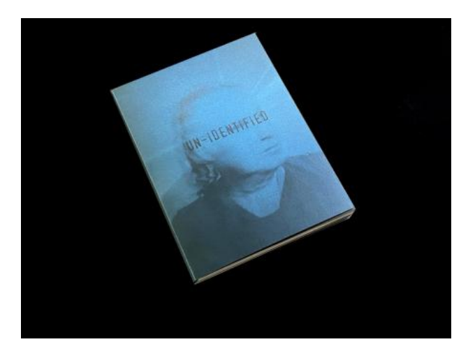
UN-IDENTIFIED, 2022 CMYK printing