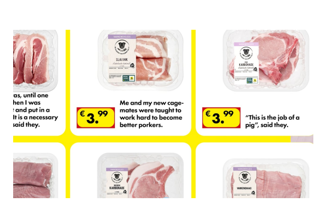
HANG THE PIG: Exploring the culturally situated notion of failure using image representation in different ideologies, 2022 2'09"