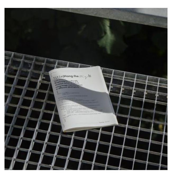
Hang the Pig, 2022 Greyscale, Size: 210 x 150mm ; 60 pages, 13,500 words