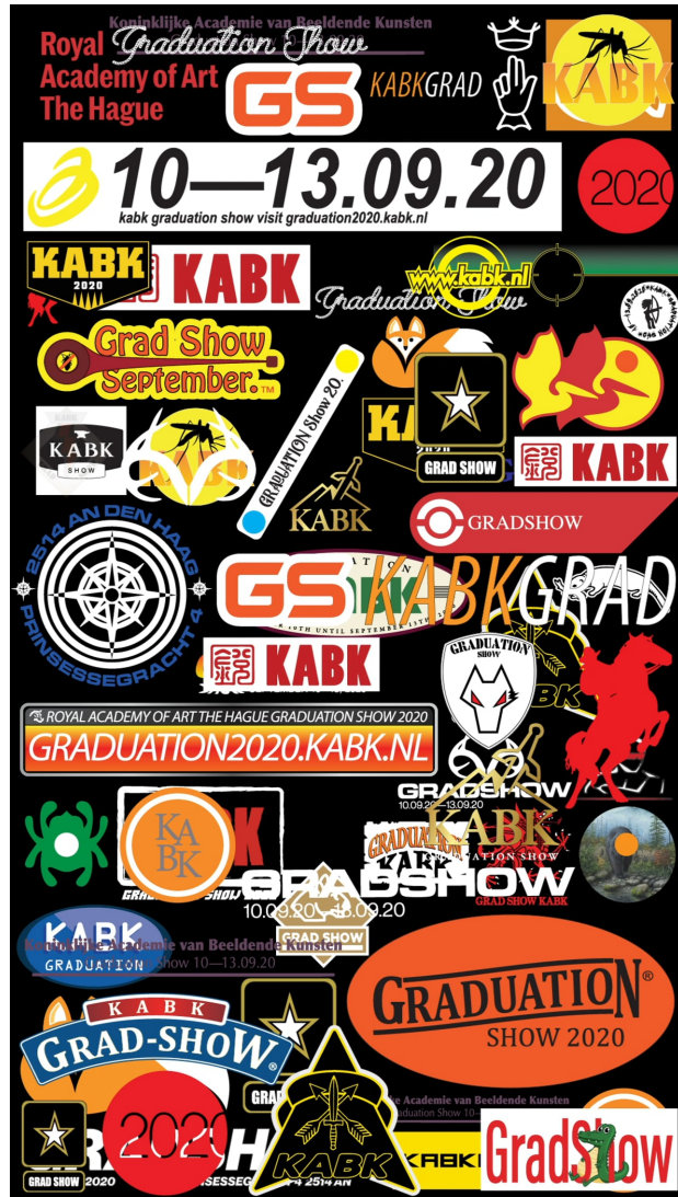
Graduation show 2020 campaign, 2020