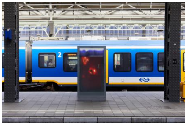
Shadow Mishi, 2023 Zbrush, Substance Painter, Blender, Photoshop, After Effects