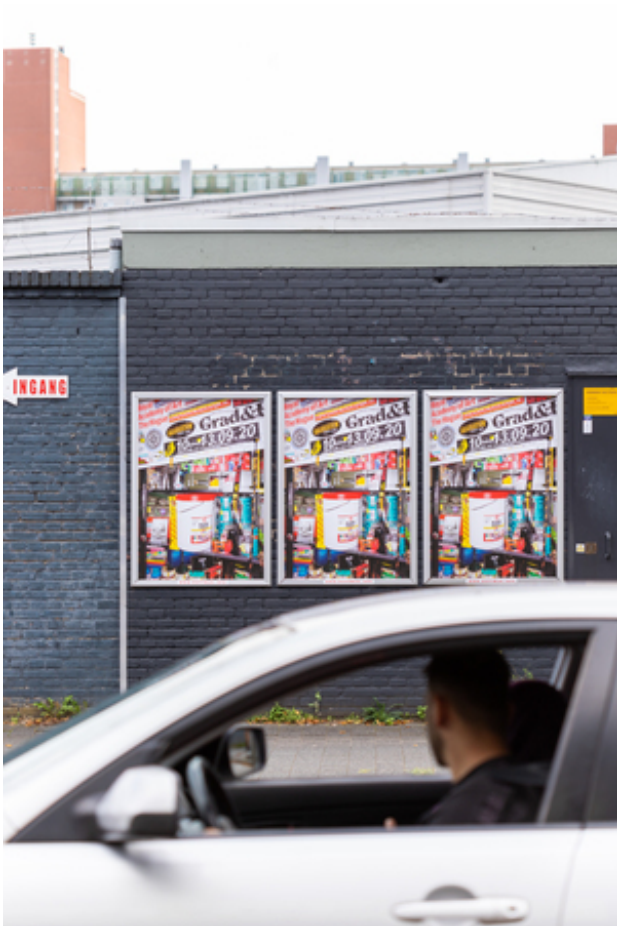
Graduation show 2020 campaign, 2020