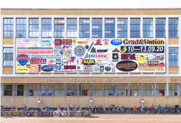
Graduation show 2020 campaign, 2020