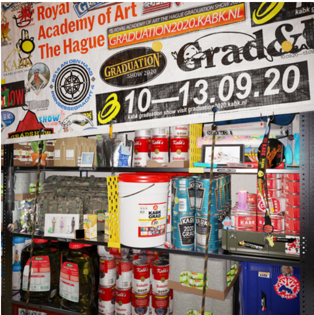
Graduation show 2020 campaign, 2020