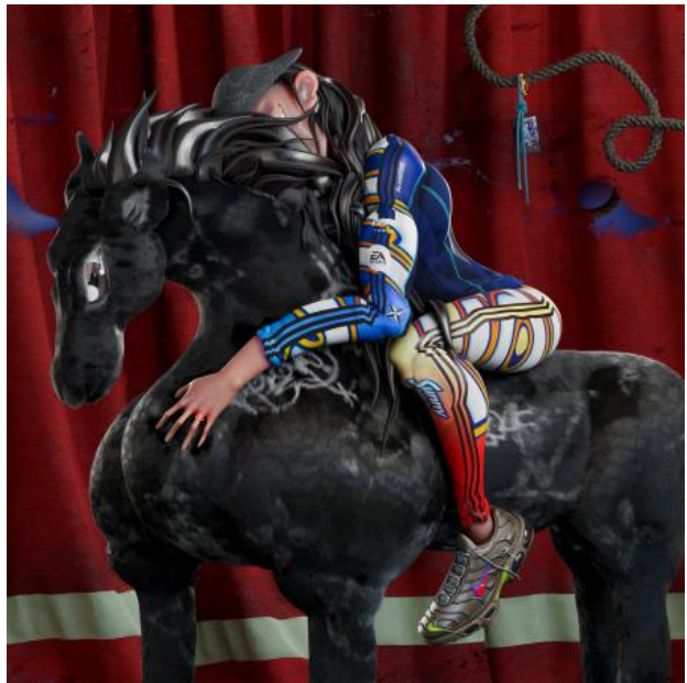
Man on a Horse, 2022