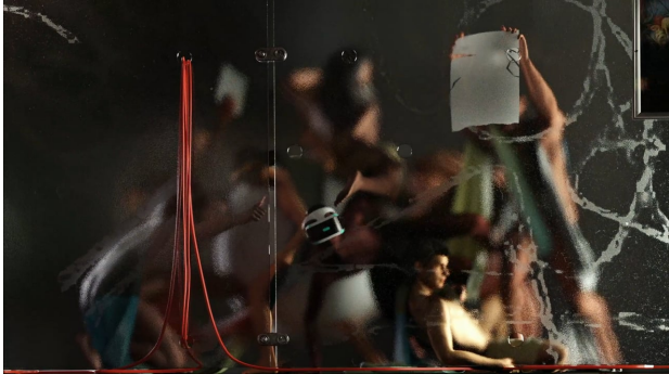
Open Day 2020 campaign, 2020