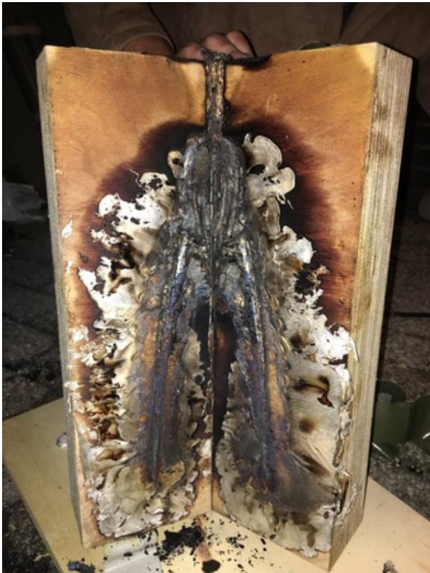
Reproducy Salif, 2018 Aluminium casting, 250mm x 250mm x 350mm