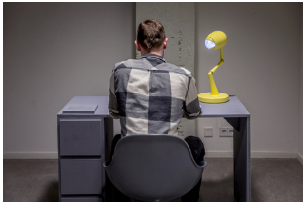
Dennis The Desklamp, 2020 3D printing, electronics, coding, 300mm x 300mm x 550mm