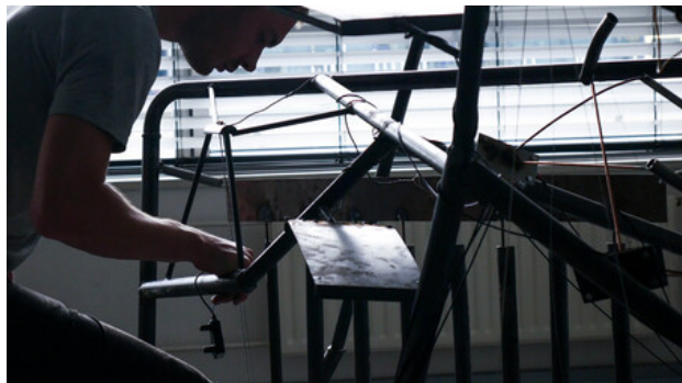
Untitled #10, 2017 Metal, piezoelectric pickup, 2100mm x 1200mm x 2200mm