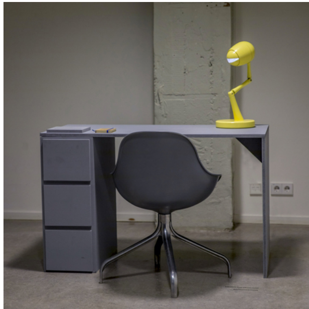
Dennis The Desklamp, 2020 3D printing, electronics, coding, 300mm x 300mm x 550mm