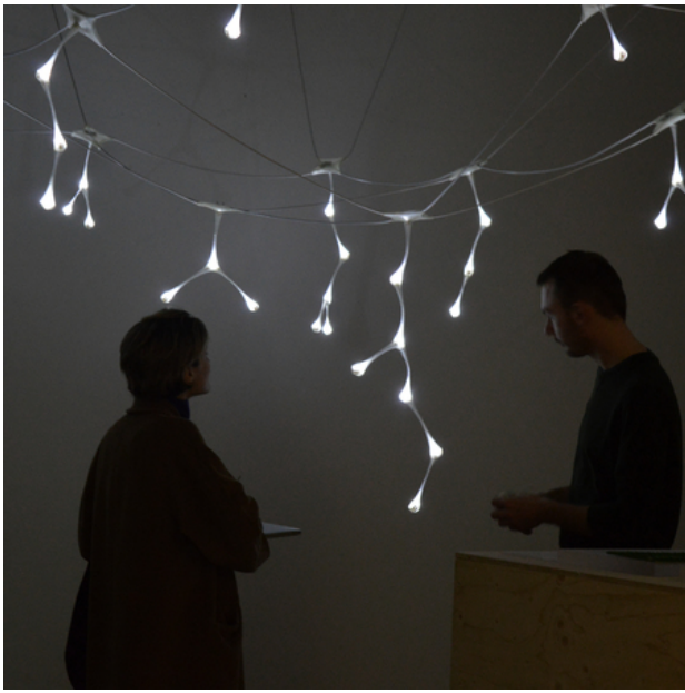
Mingling Lights, 2020 3D printing, electronics, magnets, 32mm x 32mm x 165mm