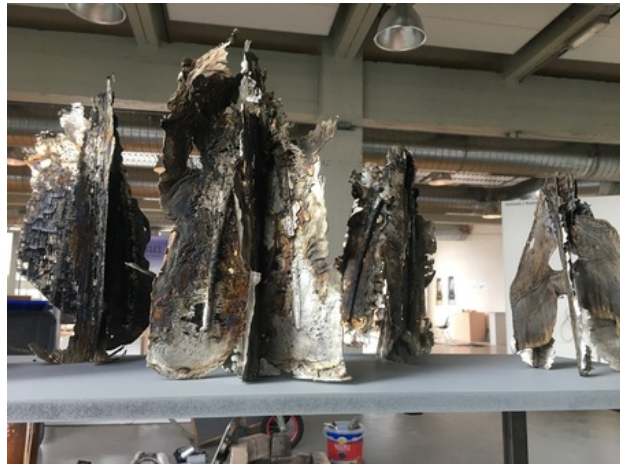
Reproducy Salif, 2018 Aluminium casting, 250mm x 250mm x 350mm