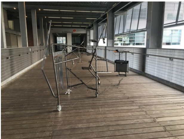
Untitled #10, 2017 Metal, piezoelectric pickup, 2100mm x 1200mm x 2200mm