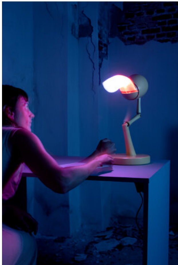
Dennis The Desklamp, 2020 3D printing, electronics, coding, 300mm x 300mm x 550mm