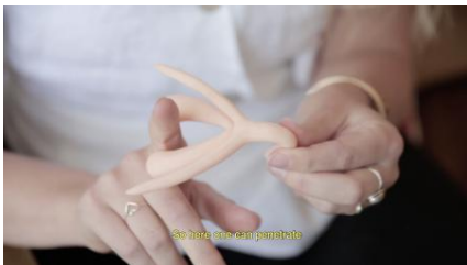
Come Here Come Here, 2019