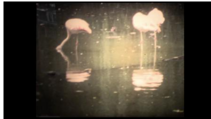
Come Here Come Here, 2019