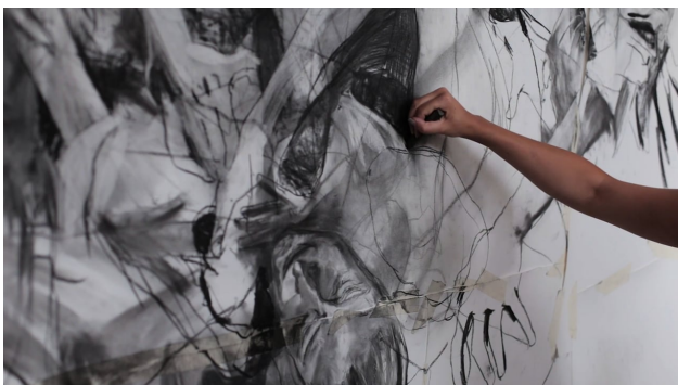
FINDING ARTEMISIA - Un-Heroic Traditions, 2020 14:09