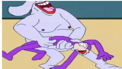
Come Here Come Here, 2019