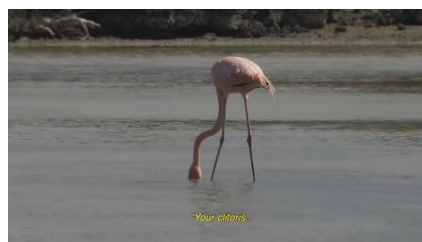
Come Here Come Here, 2019