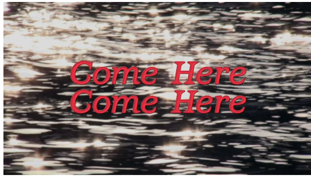
Come Here Come Here, 2019 27:46