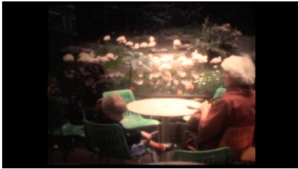
Come Here Come Here, 2019