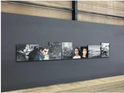
Fault Line, 2024