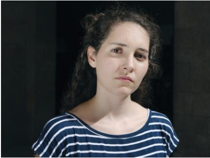
Fault Line, 2023