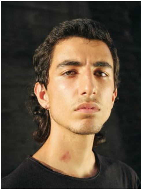
Fault Line, 2023