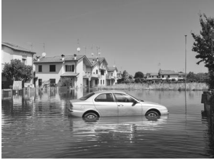
Fault Line, 2023