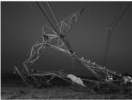
Fault Line, 2023