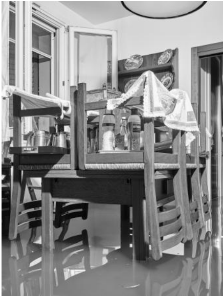
Fault Line, 2023