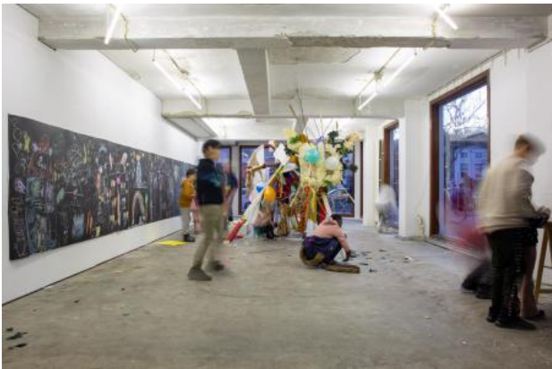
THE THING, 2022