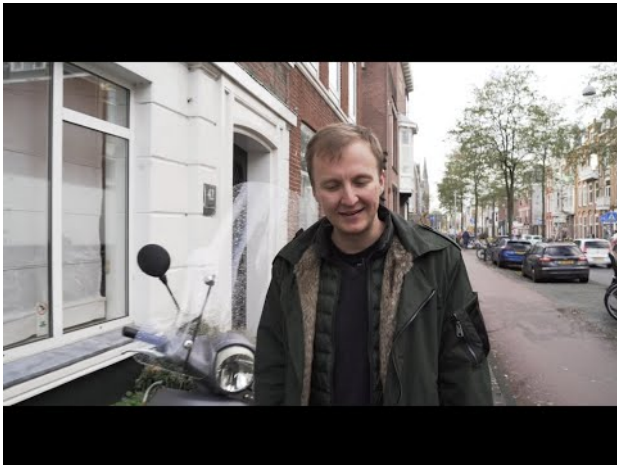
Your Sencirly, 2022 9 minutes