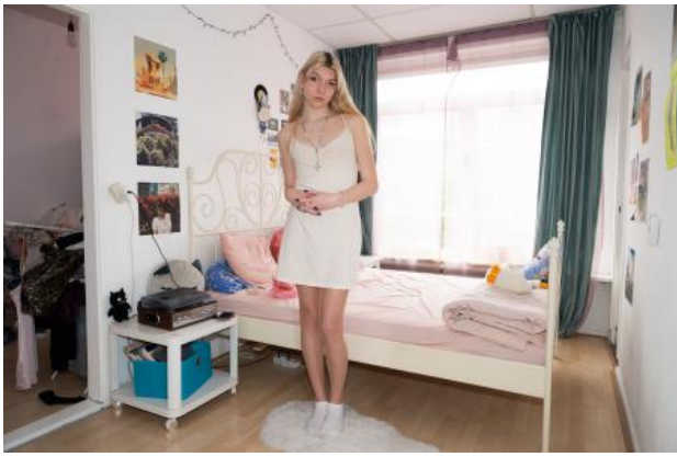
In My Room , 2023