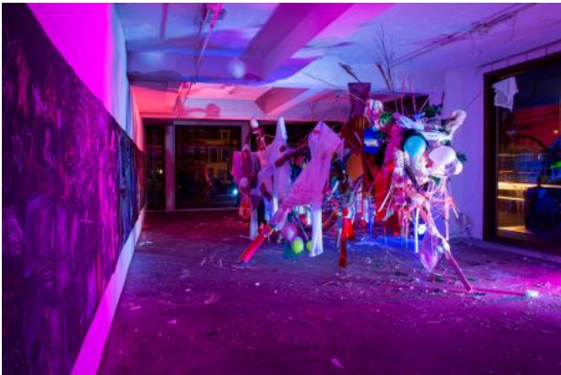
THE THING, 2022