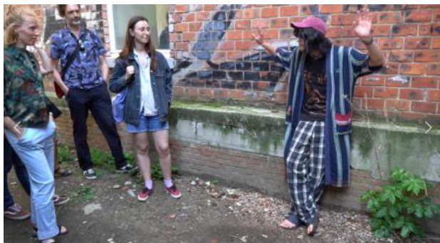
Star Ahead, Far Behind, 2024 performance

2020 Academy Prize Koninklijk Academie van Beeldenkunsten Den Haag, Netherlands Nomination