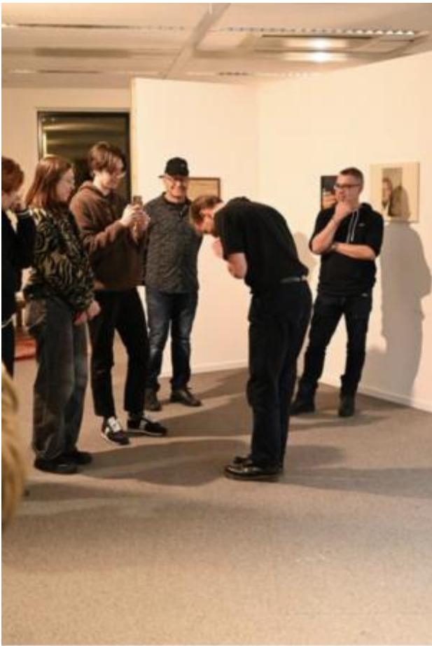
Homebound, 2023 Performance