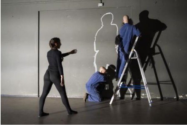
From Here We Go Sublime, 2021