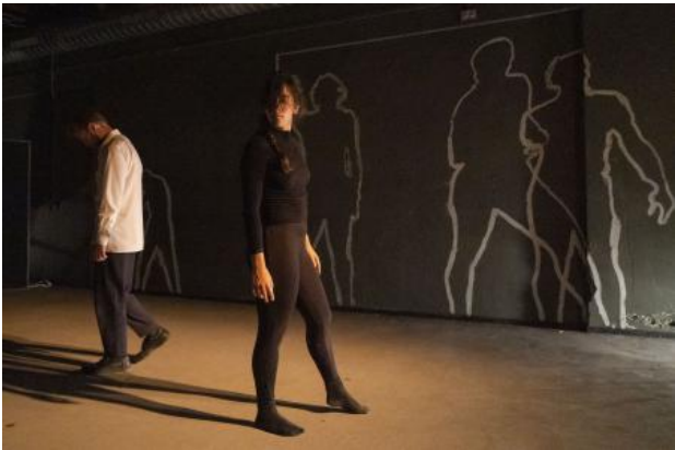
From Here We Go Sublime, 2021