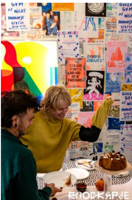
[dis]comfort food Cake Ceremony, 2023 Installation - Performance