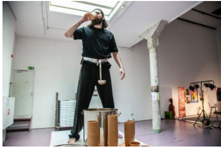
Belly, 2022 Performance/Catering