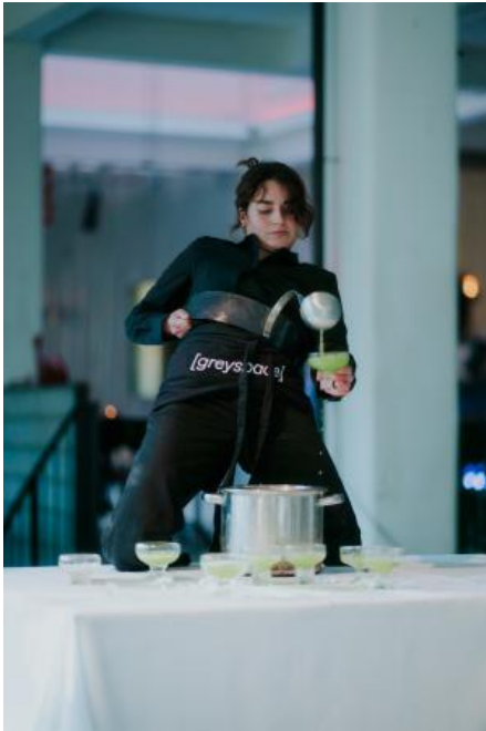
[dis]comfort food, 2023 Dinner Performance

Acousticalm MTF Stocholm Stockholm, Sweden Winning 3rd Place in 24 Hours Hackcamp that happened in MTF Stockholm. As the population of cities grow, the pressure on and crowding of infrastructure grows. Public spaces become stressful sites of sensory overload. We want to identify the the stressful factors of a given environment and offer relief, a moment of redirecting the mind and calming the body with sound. We have created two use cases, each complementing the other.