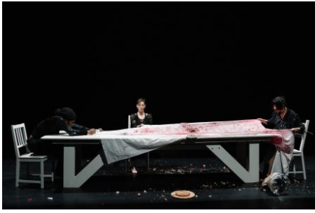
Elbows On the table, 2022 Performance