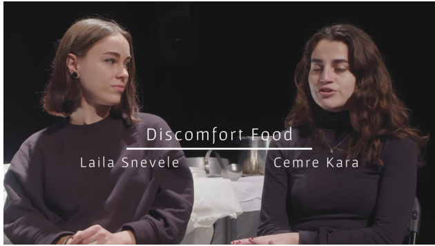
Dis]Comfort Food, 2021 2:21