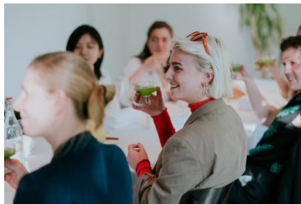
[dis]comfort food, 2023 Dinner Performance