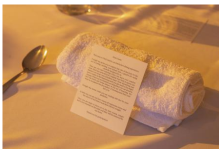
[dis]comfort food, 2023 Dinner performance