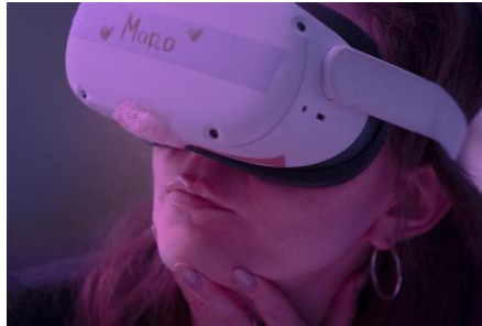
Metaphysical Tasting, 2023 Dinner performance