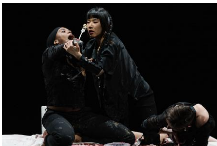
Elbows on the table, 2022 Performance