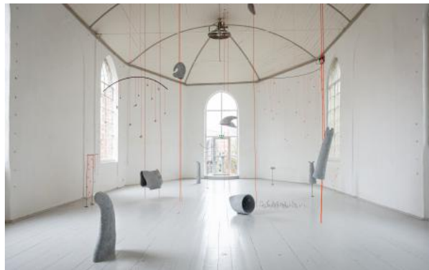
Moonhorn, 2025 ceramics, rope, audio, metal, dimension variabel