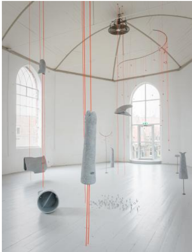
Moonhorn, 2025 ceramics, rope, audio, metal, dimension variabel