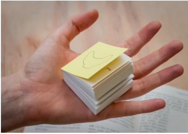
Seek You - premises of moonhorn promises, 2025 book, 13.5 x 21