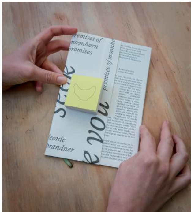
Seek You - premises of moonhorn promises, 2025 book, 13.5 x 21