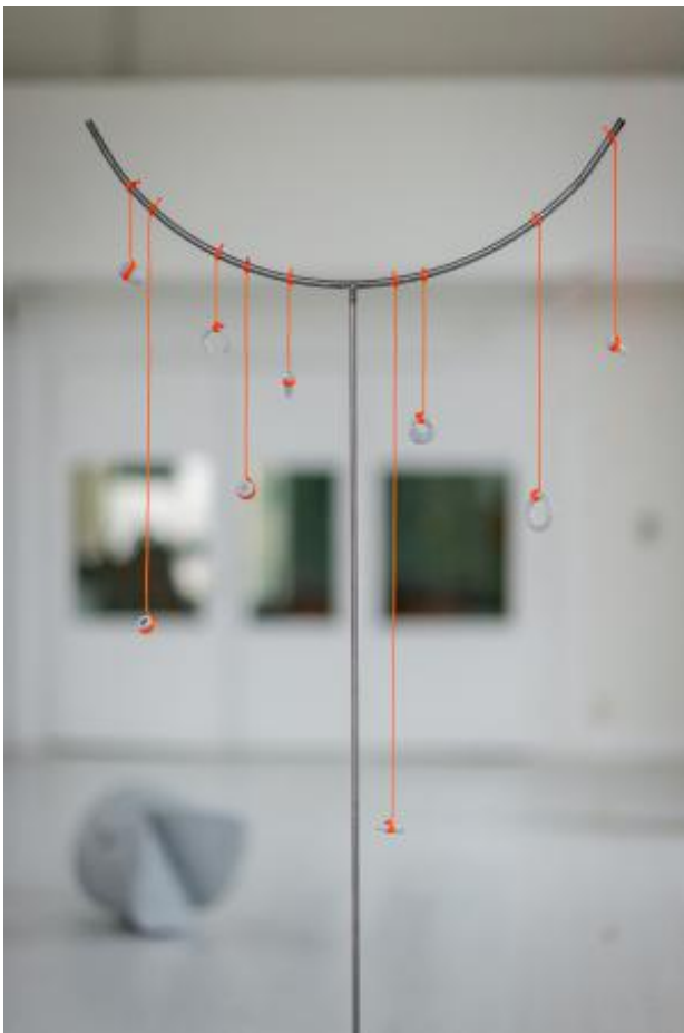
Moonhorn, 2025 ceramics, rope, audio, metal, dimension variabel