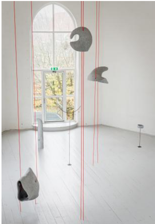
Moonhorn, 2025 ceramics, rope, audio, metal, dimension variabel