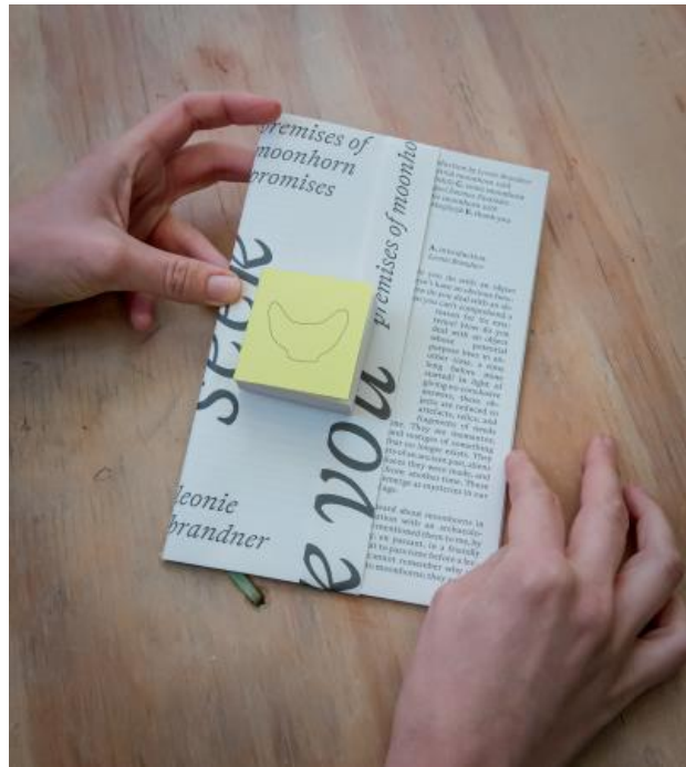
Seek You - premises of moonhorn promises, 2025 book, 13.5 x 21