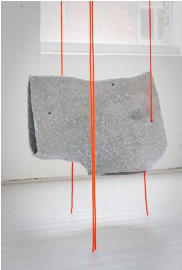
Moonhorn, 2025 ceramics, rope, audio, metal, dimension variabel