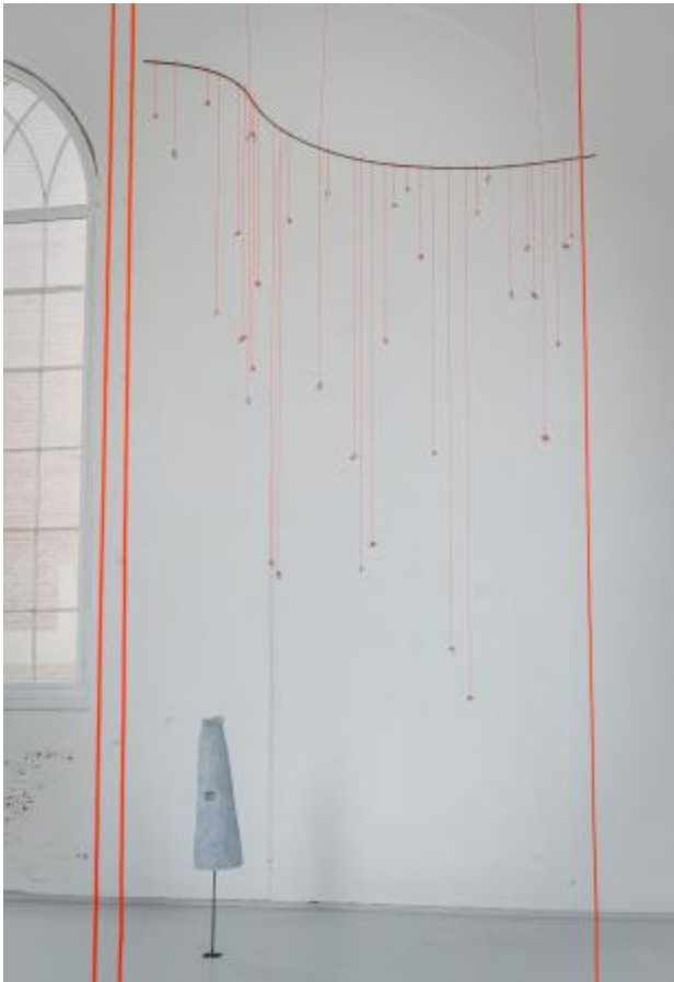
Moonhorn, 2025 ceramics, rope, audio, metal, dimension variable

2020 - Guest Tutor Chelsea College of Art 2020