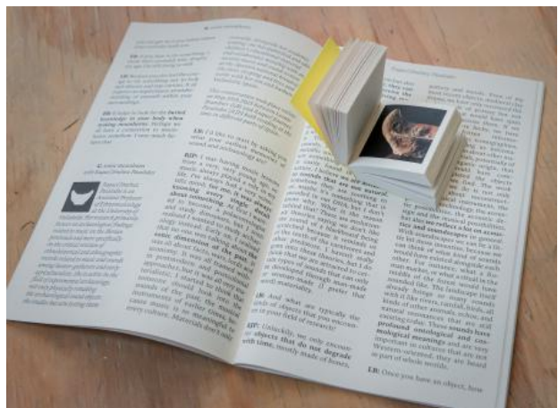
Seek You - premises of moonhorn promises, 2025 book, 13.5 x 21