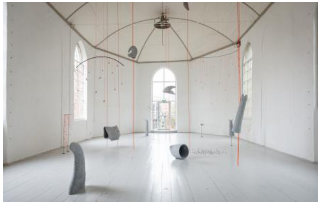
Moonhorn, 2025 ceramics, rope, audio, metal, dimension variabel