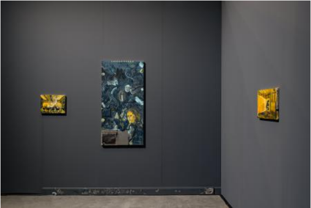
Prospects overview, 2024 Paintings and skirting board