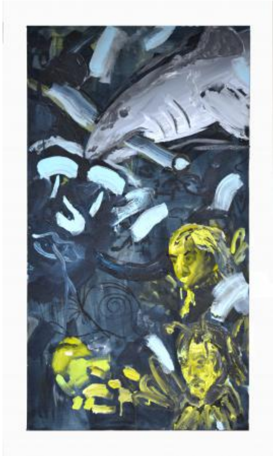
cable nibble tasting menu, 2025