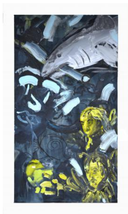
cable nibble tasting menu, 2025