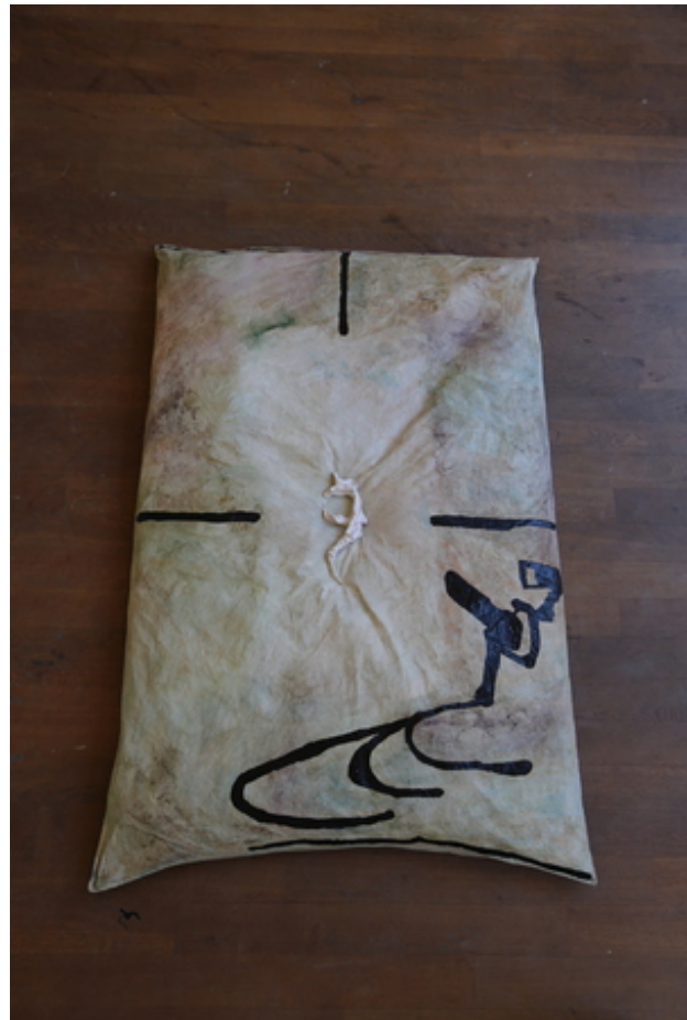
Fossil, 2020 Oil paint, oil crayons mixed with linseed oil on duvet sheet, clay, duvets, 140cm x 200cm x ca. 10 cm