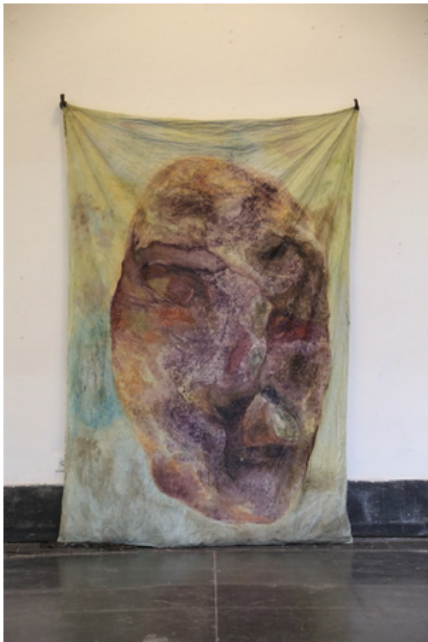
Exhausted from being, 2020 Oil crayons mixed with linseed oil and turpentine and oil paint on duvet sheet, 200 x 140 x ca. 5 cm