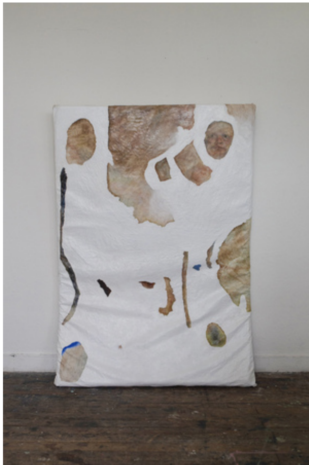
Site, 2020 Oil crayons mixed with linseed oil and turpentine and oil paint on duvet sheet, foam, 190 x 130 x ca. 8 cm