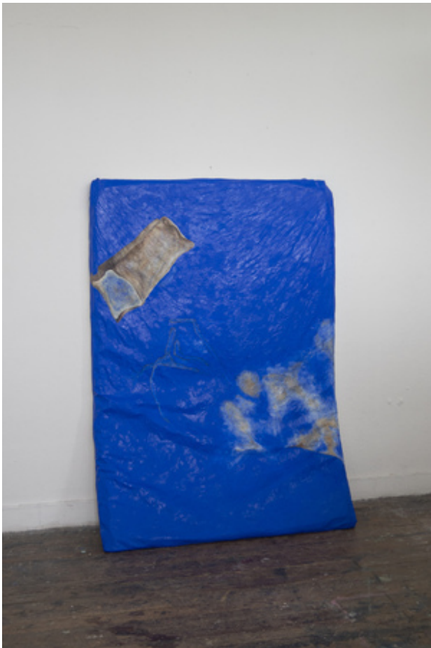
Old Bread, 2020 Oil paint mixed with turpentine on duvet sheet, foam, 180 x 130 x ca. 8 cm