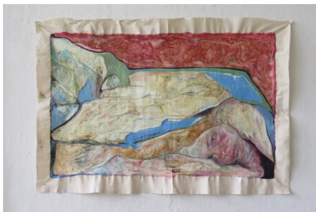
Body and Bed, 2020 Oil paint and oil crayons on unstretched canvas, 120x80cm