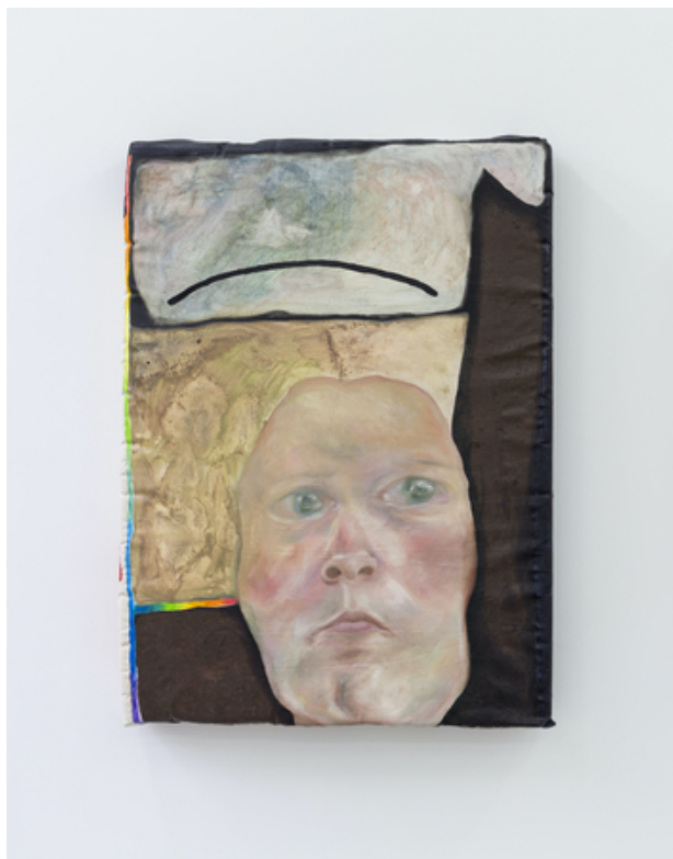
Untitled (What now), 2020 Oil on canvas, foam, 89cmx120cm