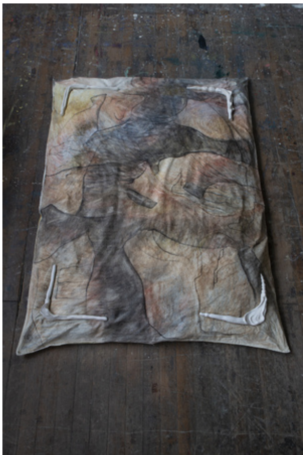
Cartography, 2020 Oil crayons and linseed oil on duvet sheet, ceramic clay, duvets, foam, 140cmx200cm