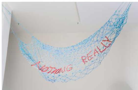
Nothing really, 2022 Handdyed and tied cotton rope