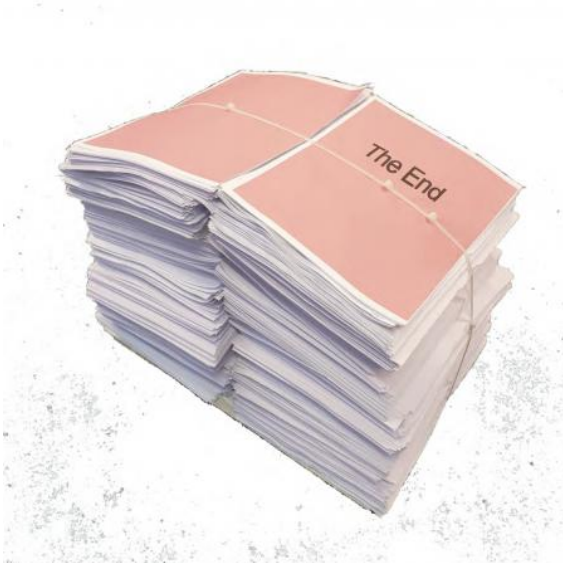
You are sitting on it, 2022