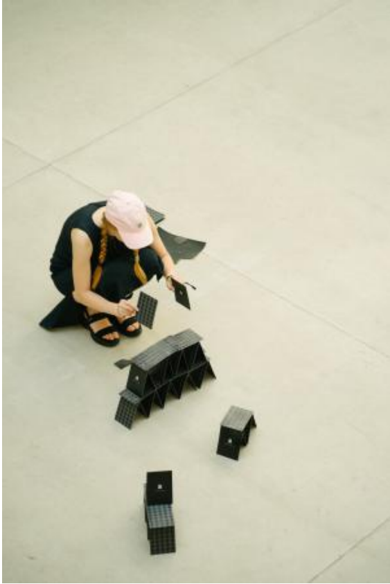
Who's laughing now, 2023 Performance, -