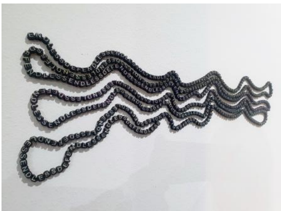
ENDLESSDEFENDLESS, 2024 Acryl, wood, 50 x 30 cm