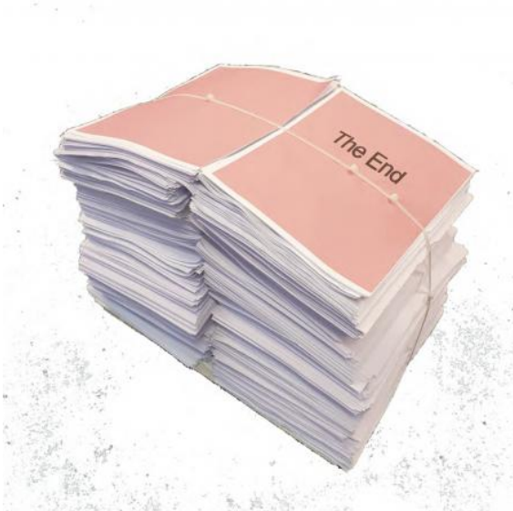
You are sitting on it, 2022