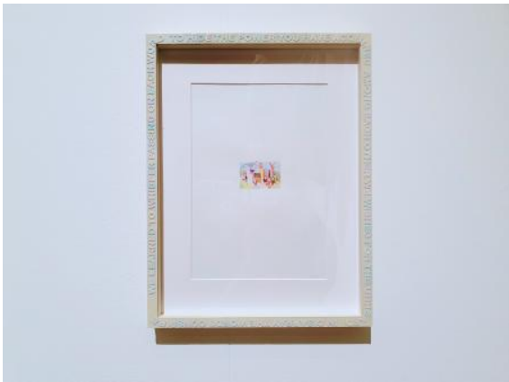
To hide the power you have acquired, 2024 Acryl on hahnemühle-paper, wooden frame, 50 x 40 cm

2014 - Member of FRANK Gallery & Studios, 2016 Malmö, Sweden