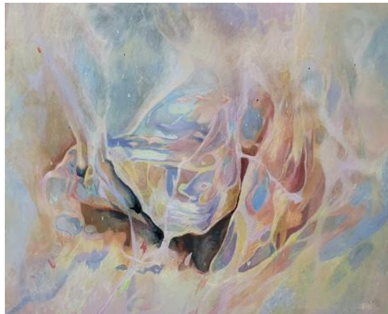
Perservere, 2024 Acryl and heatgun on canvas, 60 x 50 cm