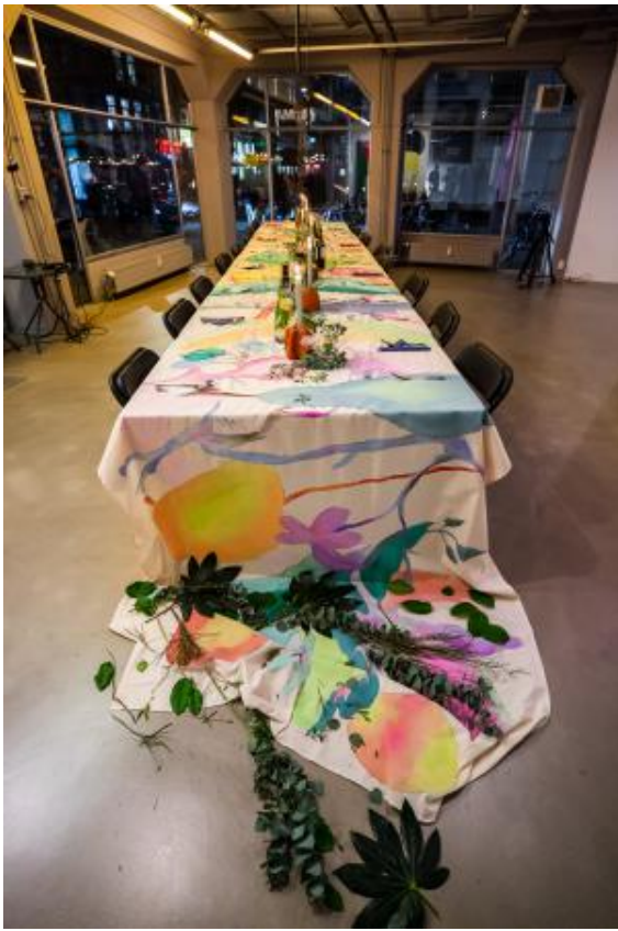
Have A Seat!, 2022 Acrylic, 2.2 x 10 m