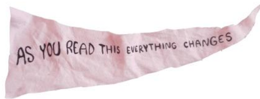
As you read this everything changes, 2022