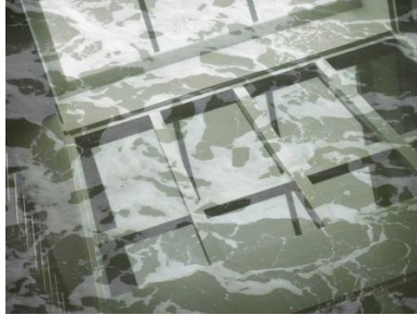
The abundance, 2023 Mixed media , 30x40