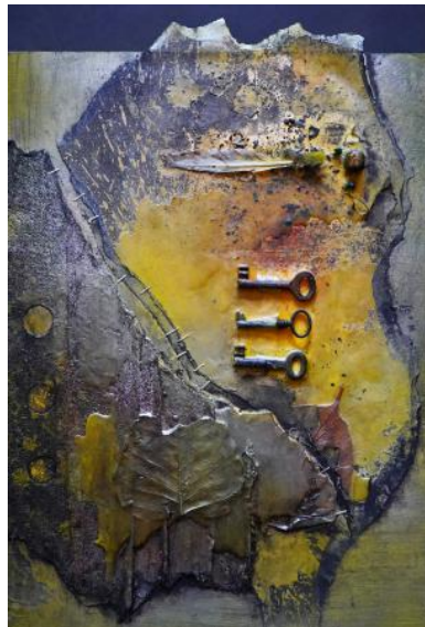
The last hope , 2023 Mixed media , 37x50