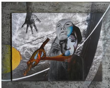
The disguise , 2023 Mixed media , 48x39