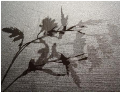
Photoserie "The flow of life", 2023 Photography , 40x30