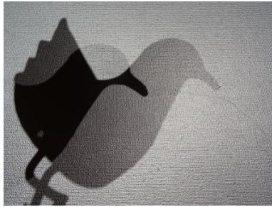
Photoserie "The flow of life", 2023 Photography , 40x30