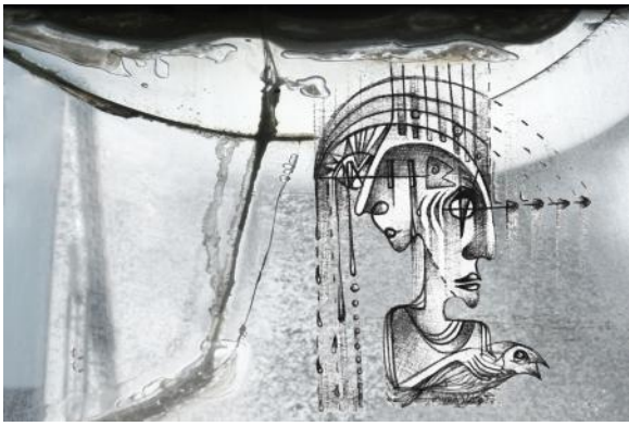
I and you , 2023 Mixed media , 15x10