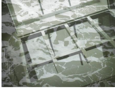
The abundance, 2023 Mixed media , 30x40