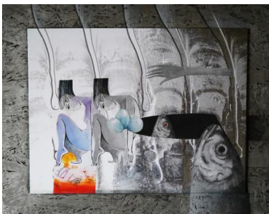
The inspiration , 2023 Mixed media , 48x39