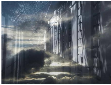
Coming and going , 2023 Mixed media , 30x40