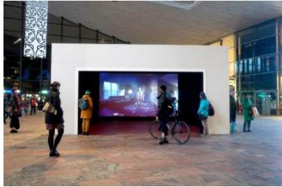
Unfolding (International Film Festival Rotterdam, 2024), 2024 Video Installation, 7mx7mx3m