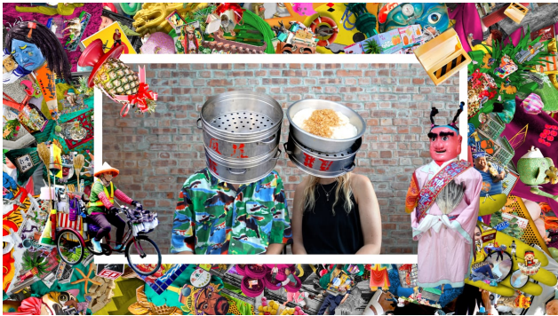
News From Home - Kaohsiung (2024), 2024 11:12