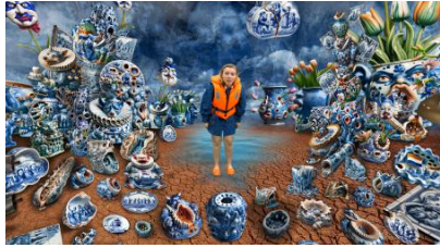
Revival Roadshow, 2025 3-DoF virtual reality, 360° video., installation (various)