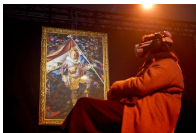
Revival Roadshow, 2025 3-DoF virtual reality, 360° video., installation (various)