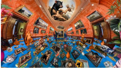
Revival Roadshow, 2025 3-DoF virtual reality, 360° video., installation (various)