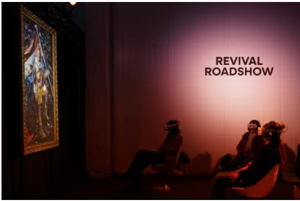
Revival Roadshow, 2025 3-DoF virtual reality, 360° video., installation (various)