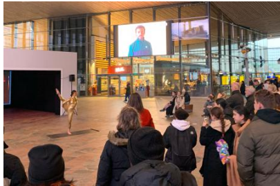
Unfolding (International Film Festival Rotterdam, 2024), 2024 Video Installation/Performance, 7mx7mx3m