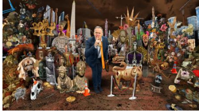
Revival Roadshow, 2025 3-DoF virtual reality, 360° video., installation (various)