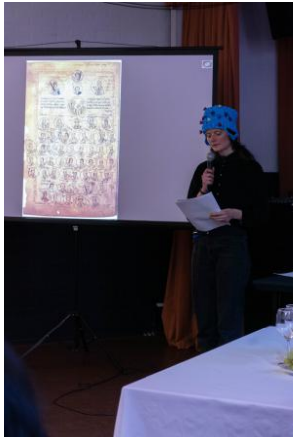
Of soft tannins, complex beliefs and mouthful communities, 2025 wine tasting performance