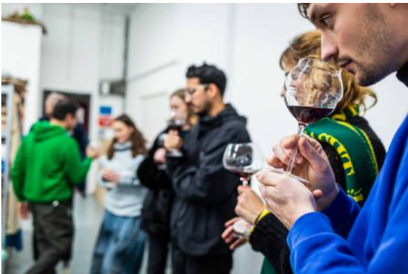
Vinous Landscape studio visit, 2024 performative wine-tasting, 1h