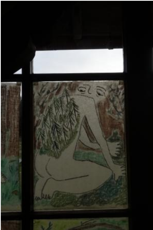
The Flies, 2024 Baking paper, dry pastel, approx. 25x30cm