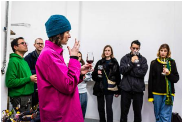
Vinous Landscape studio visit, 2024 performative wine-tasting, 1h