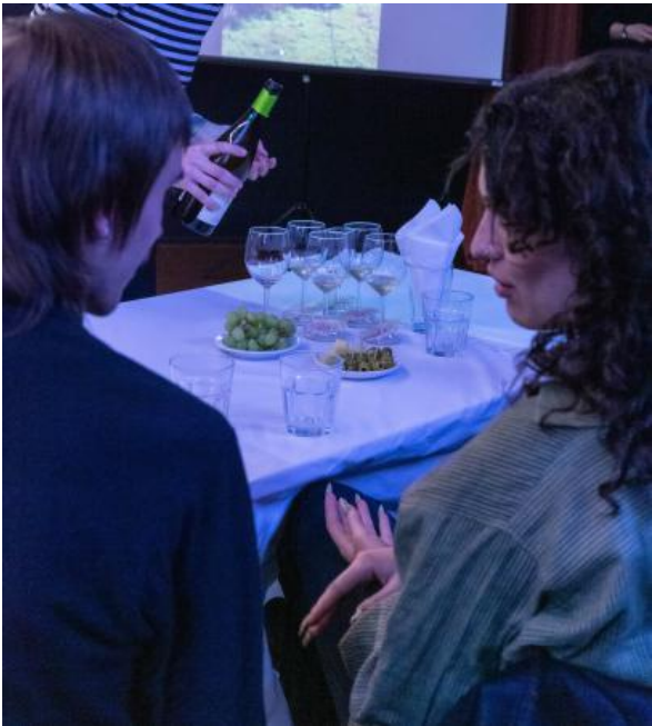
Of soft tannins, complex beliefs and mouthful communities, 2025 wine tasting performance