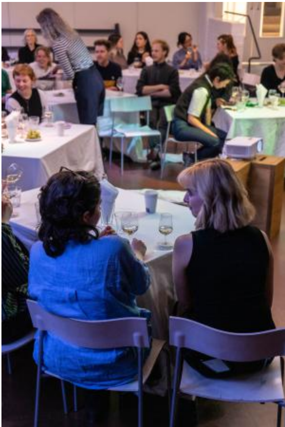
Of soft tannins, complex beliefs and mouthful communities, 2025 wine tasting performance