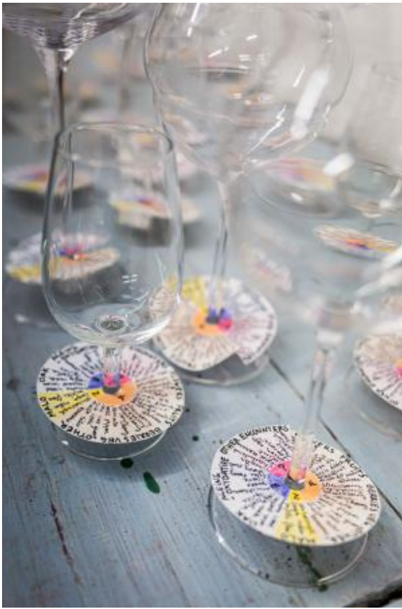
Vinous Landscape studio visit, 2024 performative wine-tasting, 1h