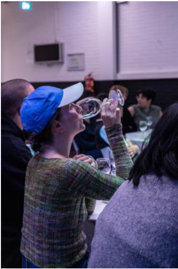
Of soft tannins, complex beliefs and mouthful communities, 2025 wine tasting performance