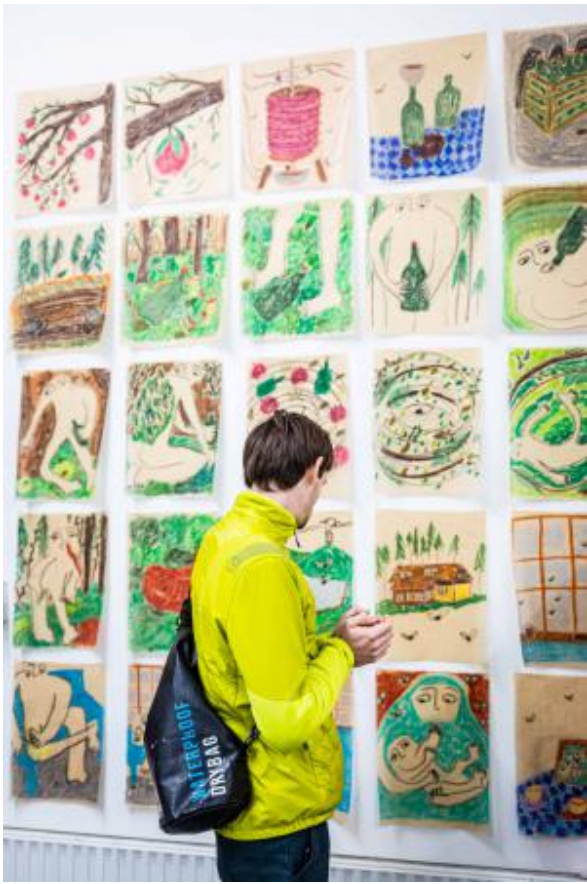
The Flies, 2024 Baking paper, dry pastel, approx. 25x30cm