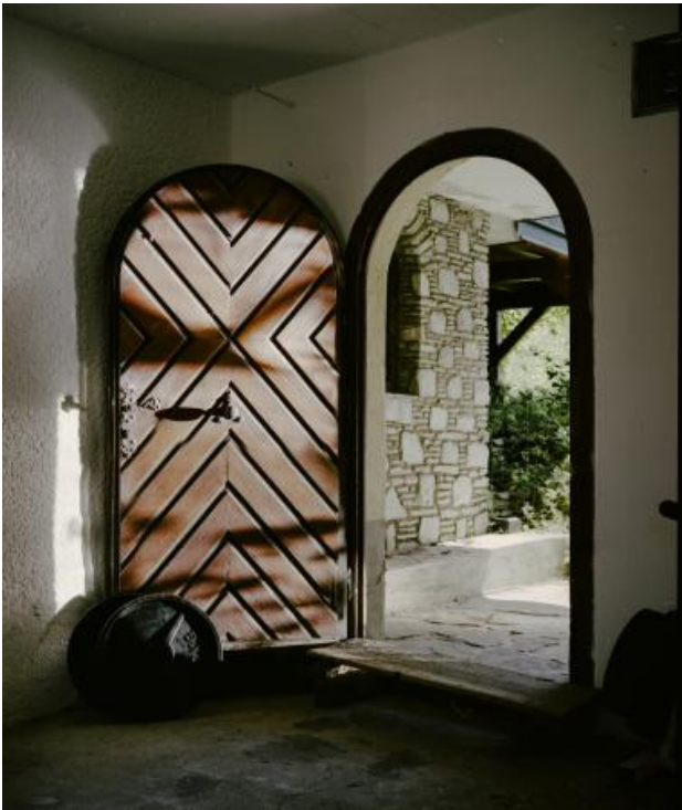
Flex Kurz, 2022