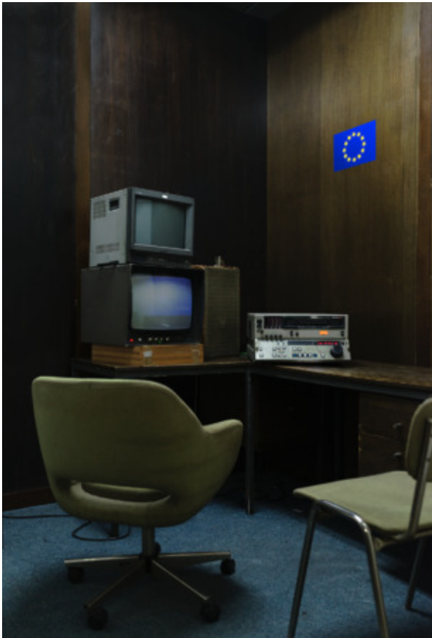
Believe it Or Not Photography