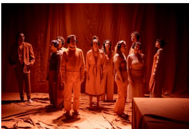
I NEVER WANNA DANCE AGAIN, 2024 photo by Mathijs Immink , Performance