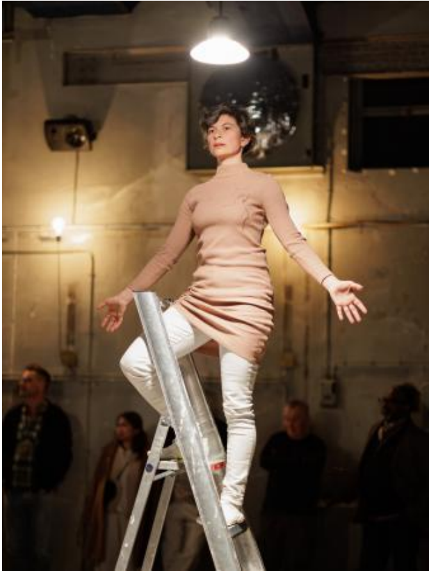
Slowly letting go of something, 2025