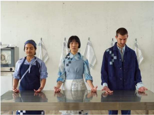
Reenacting a tradition, 2025