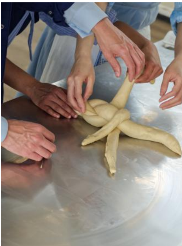
Reenacting a tradition, 2025