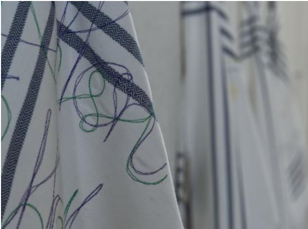
Reenacting a tradition, 2025