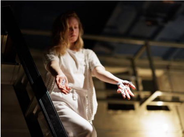
Slowly letting go of something, 2025