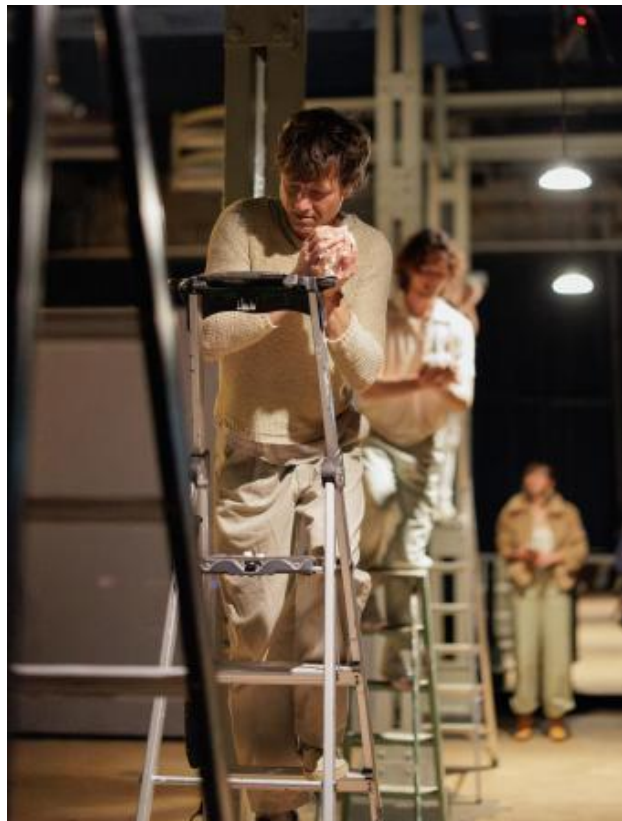
Slowly letting go of something, 2025