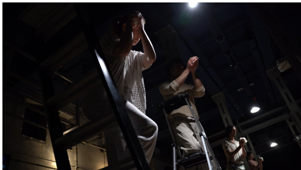
Slowly letting go of something 2025, 2025