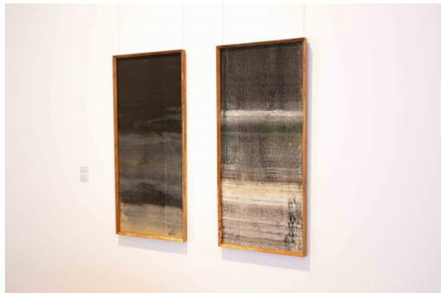
Written in sediment, 2023 48 x 110 cm, 48 x 110 cm