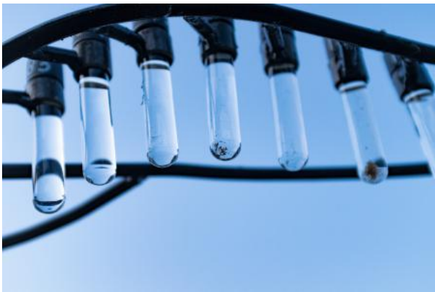
Mapping Dutch Waters, 3023 Steel, glass, water

2019 - -- Workshop cyanotype printing On-going