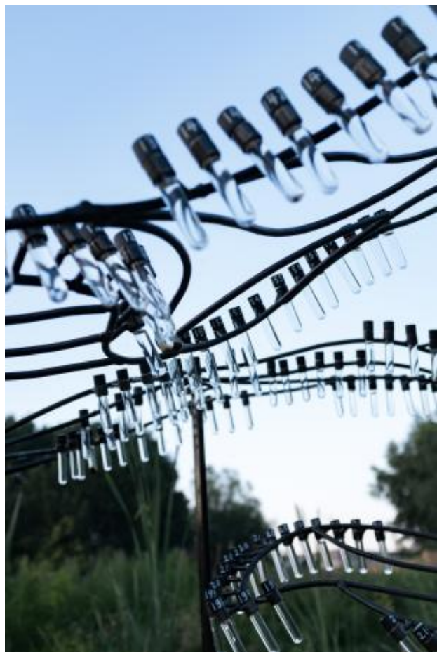
Mapping Dutch Water, 2023 Steel, glass, water