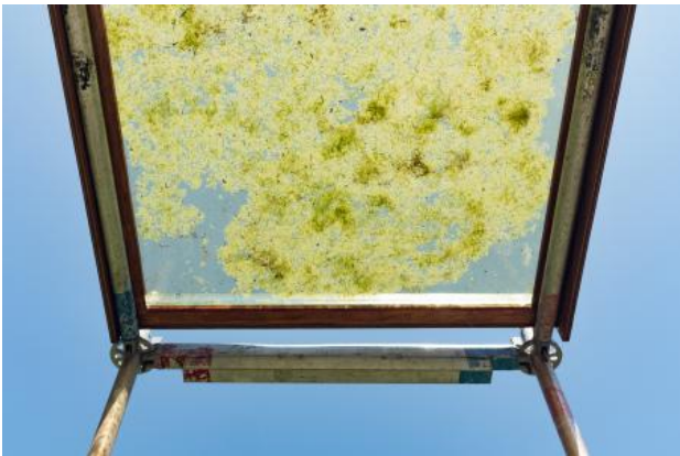
Duckweed, 2023 Schaffolding, glass, wood, water, duckweed