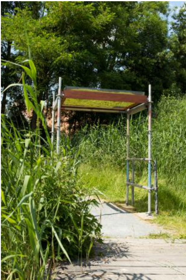
Duckweed, 2023 Schaffolding, glass, wood, water, duckweed