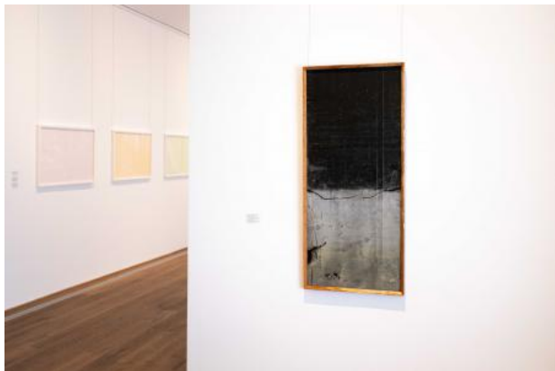
Written in sediment, 2023 48 x 110 cm, 48 x 110 cm