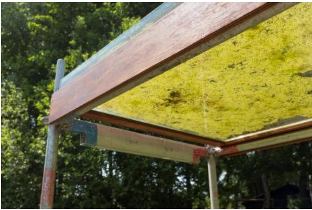
Duckweed, 2023 Schaffolding, glass, wood, water, duckweed