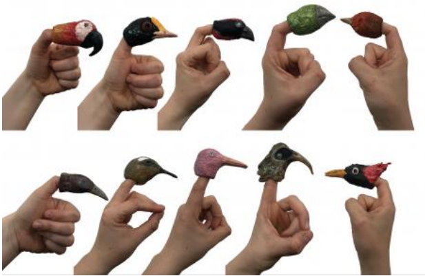
A selection of finger puppets, 2024 Air-drying clay, paint, Dimensions variable