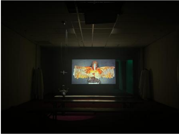
CLOUDCUCKOOLAND, 2024 Video installation, puppets