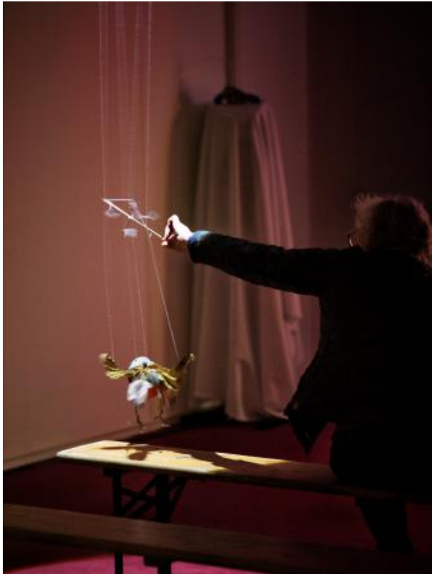
CLOUDCUCKOOLAND, 2024 Video installation, puppets