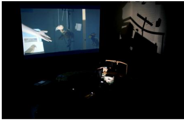
We are Sky-Breakers, 2024 Live-action essay film, 21:00