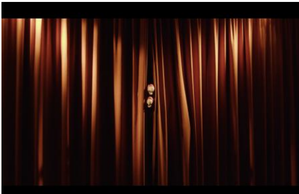
CLOUDCUCKOOLAND, 2024 Video installation, puppets