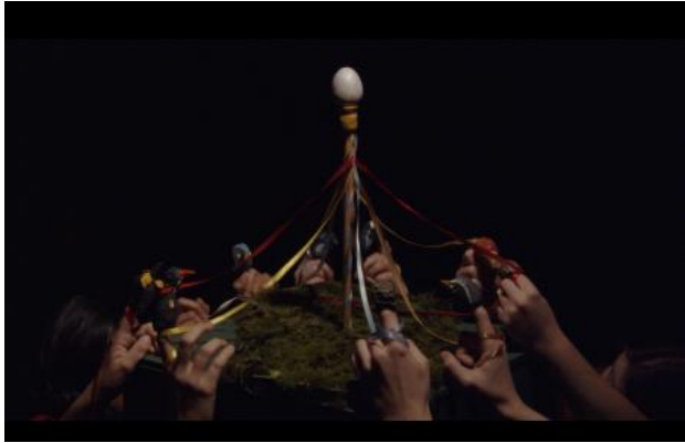
CLOUDCUCKOOLAND, 2024 Video installation, puppets