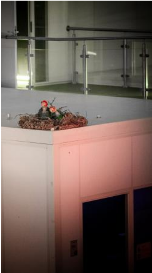
CLOUDCUCKOOLAND, 2024 Video installation, puppets