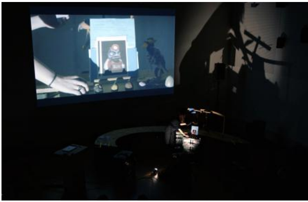
We are Sky-Breakers, 2024 Live-action essay film, 21:00