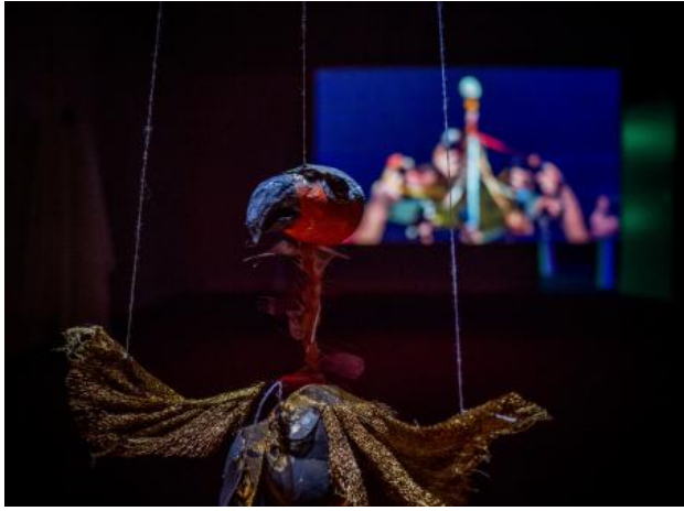
CLOUDCUCKOOLAND, 2024 Video installation, puppets