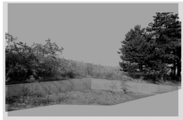
52°06'21.9" N 4°19'08.6"E, 2018 Collage