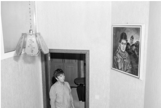
untitled, 2019 Digital photography