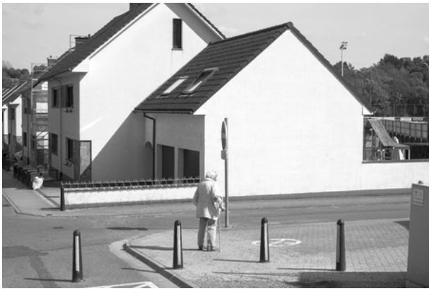
untitled, 2019 Digital photography