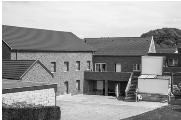
untitled, 2019 Digital photography