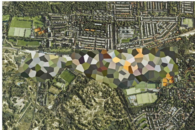
Censorship, 2019 Image appropriation