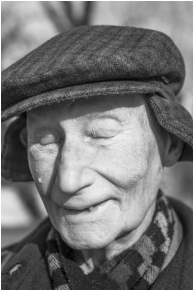
untitled, 2019 Digital photography