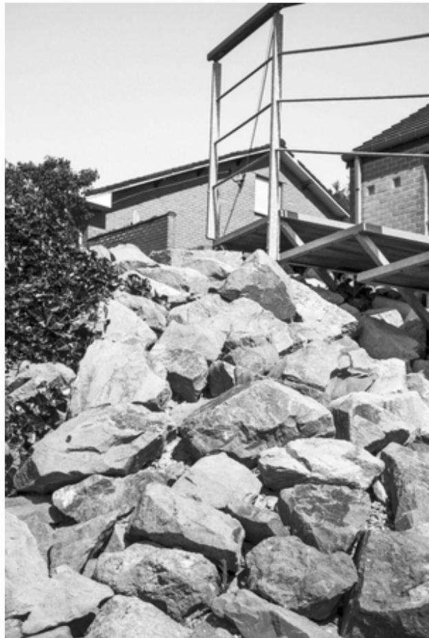
untitled, 2019 Digital photography