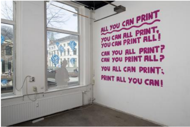
All You Can Print, 2023 Emulsion on wall