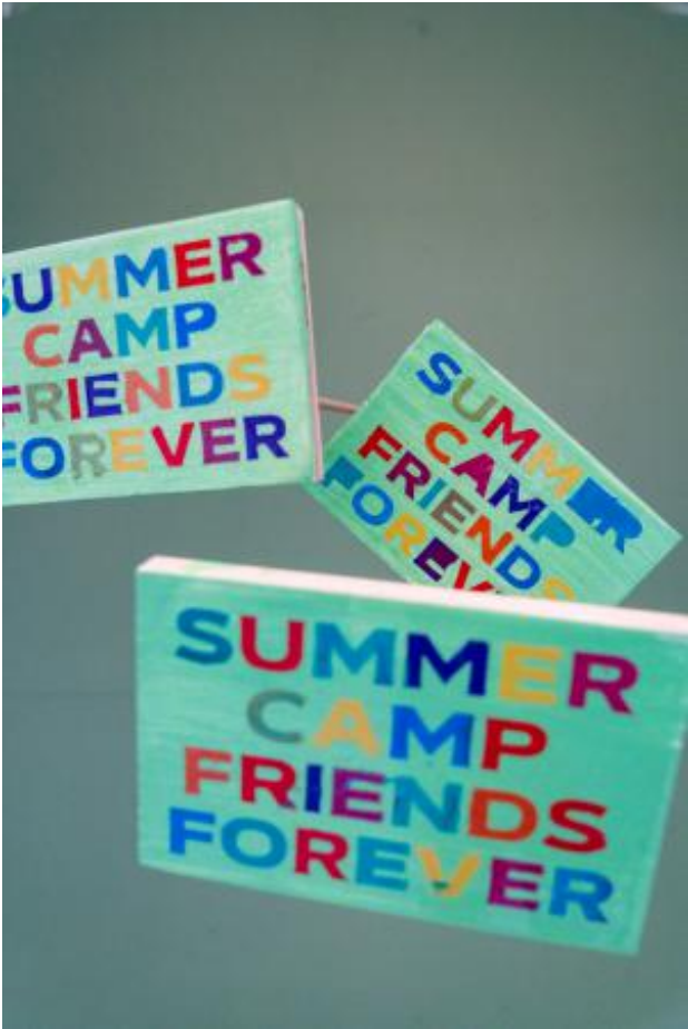
Early Birds, 2023