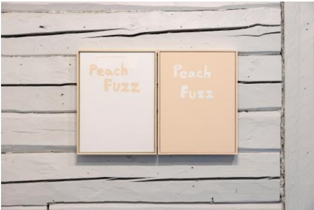
Peach fuzzz, 2024 oil paint on canvas (framed), 30x40cm

2024 Development Voucher Mondriaan Fonds, NL Netherlands 2023 Makersregeling Gemeente Den Haag 2023 Stroom Pro Invest 2022 Pro invest / Stroom, Den Haag Netherlands 2022 Stroom PRO Kunstprogramma Grant Netherlands