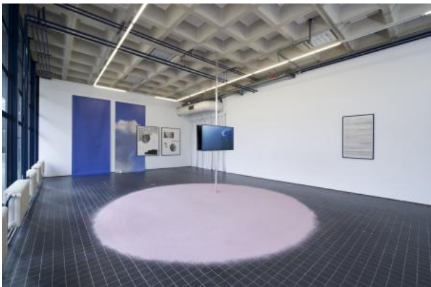
Overview This Is One Landscape, Divided at Billytown, 2023