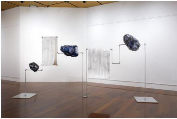
Orbiter, 2024 laser prints with synthetic resin dipersion, drawings (ink on paper), aluminium, reflective foil, wood, 406 x 60 x 220 cm