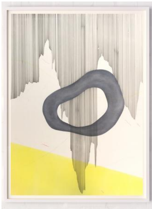
Cognitive dissonance, 2021 Drawing, ink, pastel, pigment and graphite on paper, framed, 86 x 116 cm