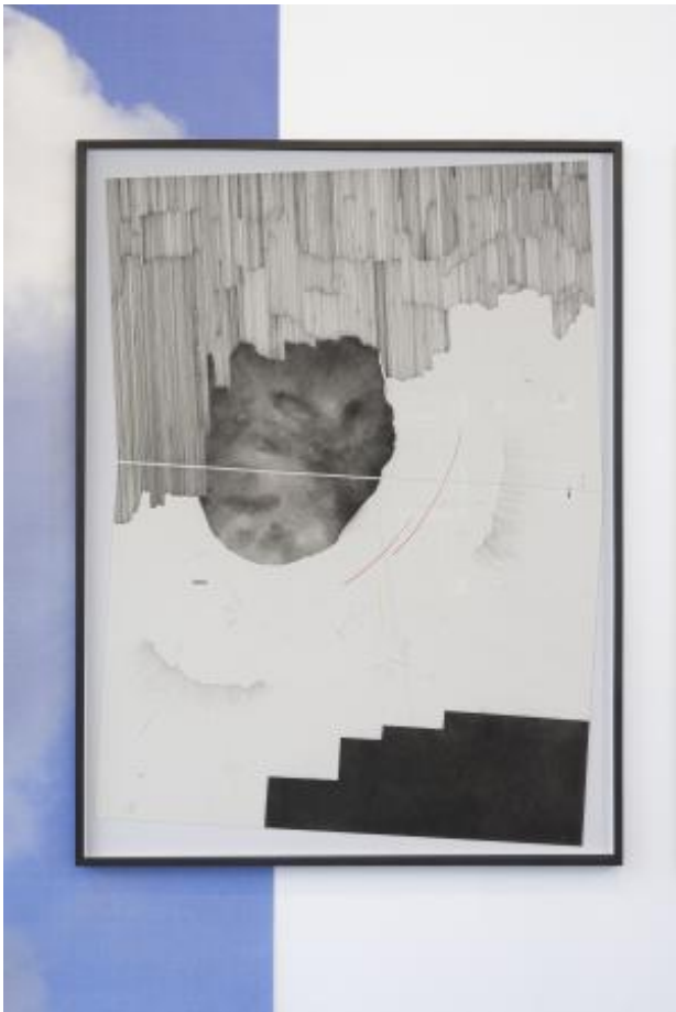
The Huge Amount Of Matter Between Me And The Distant Light Source, 2023, 2023 Pastel, ink, graphite on paper, framed (black, walnut wood, Art Glass 70% UV), 164 x 123 cm