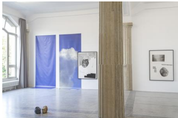
Exhibition Overview at Villa Heike Berlin, 2023 Drawing, Photography, Sculpture, Installation