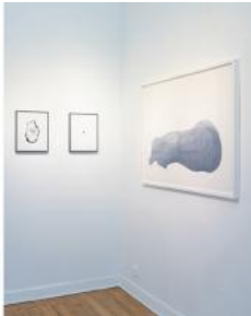
Zwischen Oben und Unten, 2022 drawing, sculpture, photography, drawing, sculpture, photography