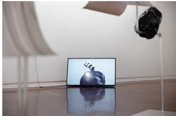
Almost, 2024 video