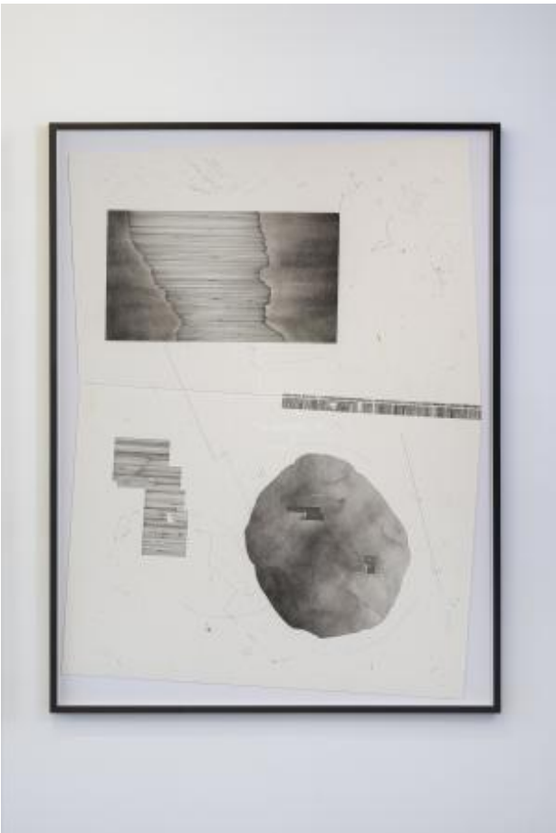
Collecting Anomalies, 2023, 2023 Pastel, ink, graphite on paper, framed (black, walnut wood, Art Glass 70% UV), 164 x 123 cm