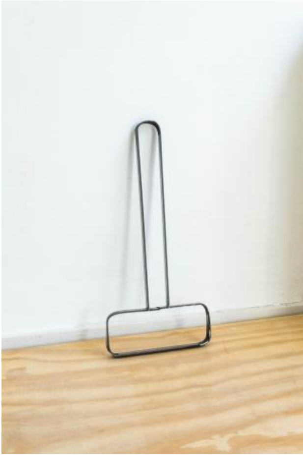
Fully Worktioneing. The Balcony , 2023