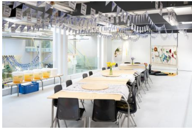
BAK. Ultradependent Public School , 2023