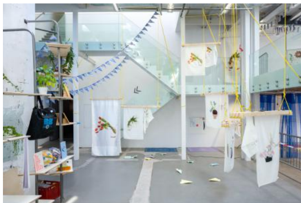
BAK. Ultradependent Public School , 2023