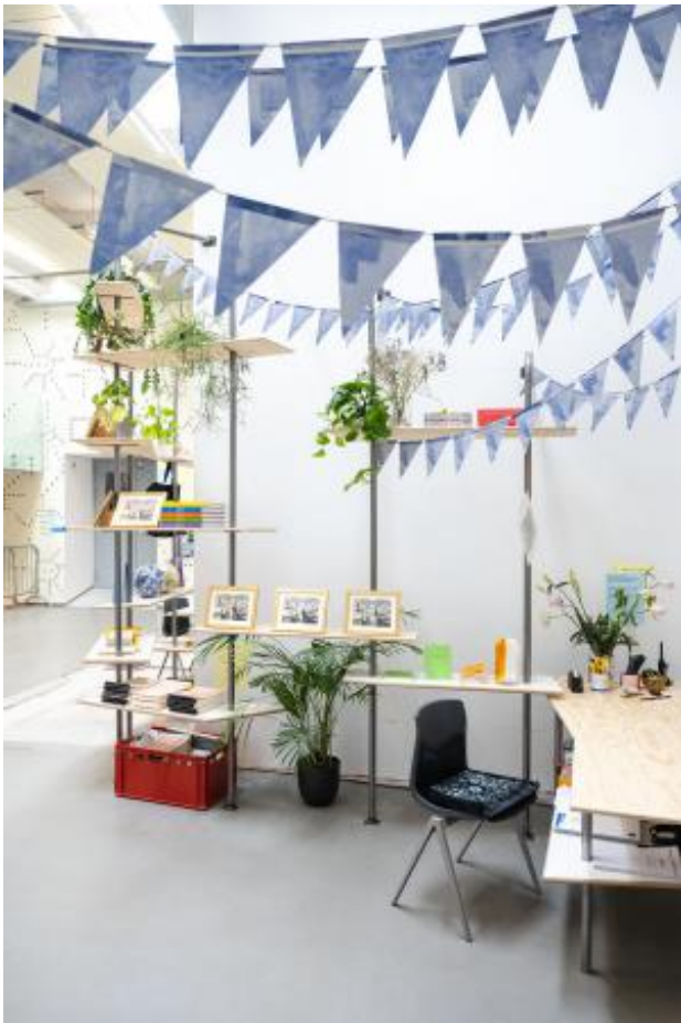
BAK.Ultradependent Public School , 2023