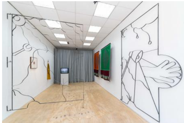
Fully Worktioneing. The Balcony , 2023