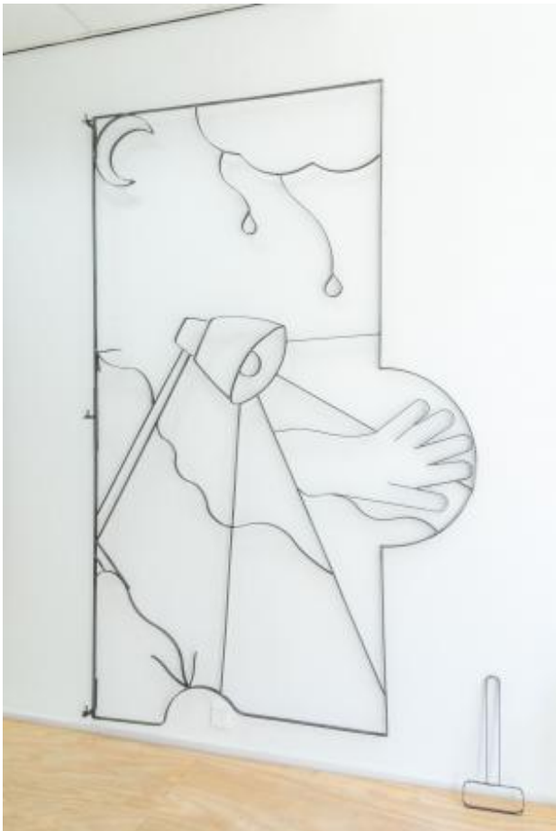
Fully Worktioneing. The Balcony , 2023