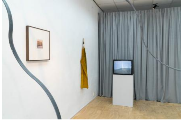
Fully Worktioneing. The Balcony , 2023