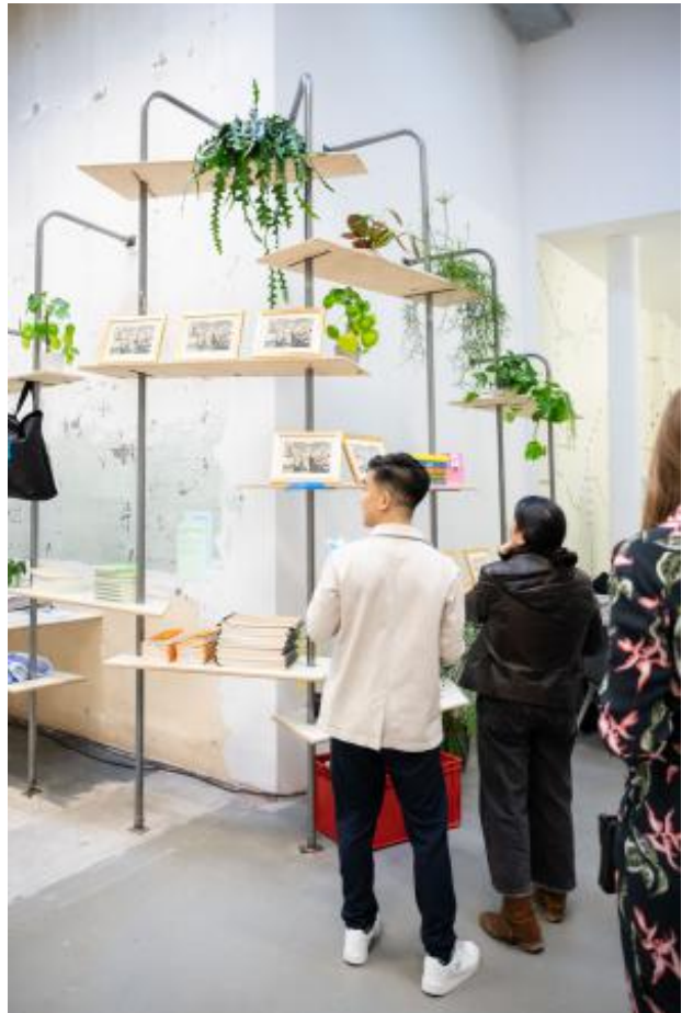
BAK. Ultradependent Public School , 2023