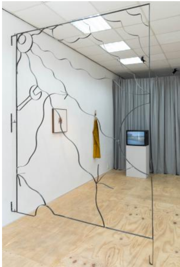
Fully Worktioneing. The Balcony , 2023