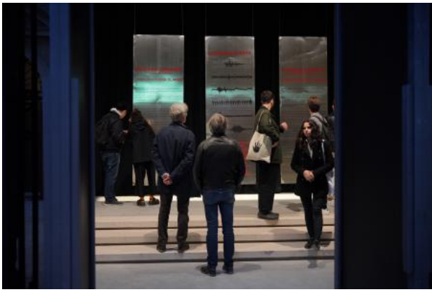
Weather Gardens, 2023 Installation