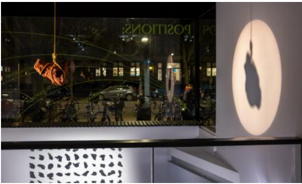
Meteorite 82149, 2023 Installation