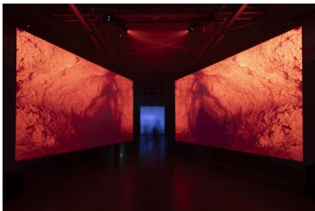
Under Boom, 2024 Film, 4K 18" 2-channel

2020 - -- Lecturer Royal Academy of Art On- going