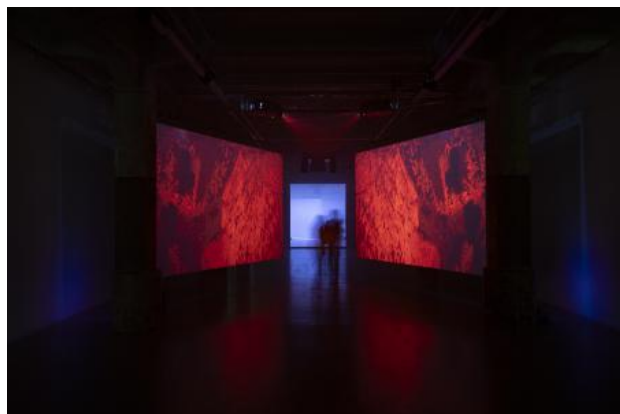
Under Boom, 2024 Film, 4K 18" 2-channel