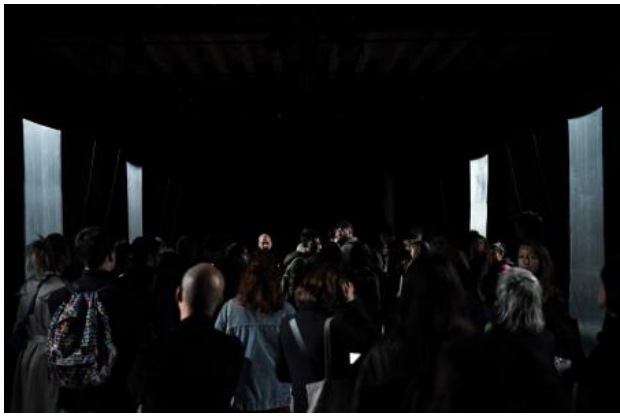
Weather Gardens, 2023 Installation