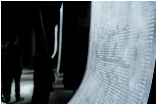
Weather Gardens, 2023 Installation