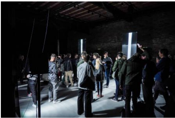
Weather Gardens, 2023 Installation