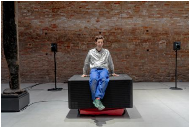
Weather Gardens, 2023 Installation