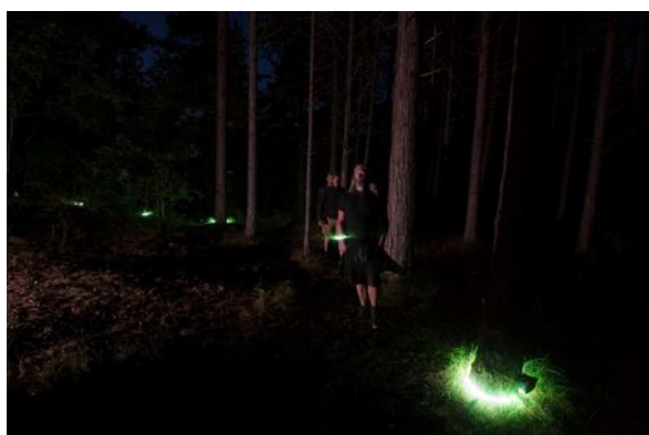
Boservaring, 2018 Sound installation, sensors, interactive lights