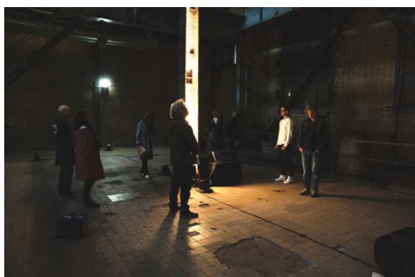
Untitled Frequencies II, 2019 Sound installation