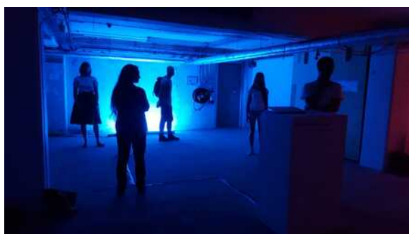
Untitled Frequencies, 2018 Sound installation