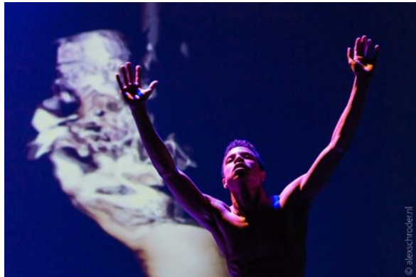
Harrison Bergeron , 2018 Projection