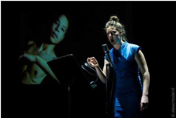
Harrison Bergeron , 2018 Projection