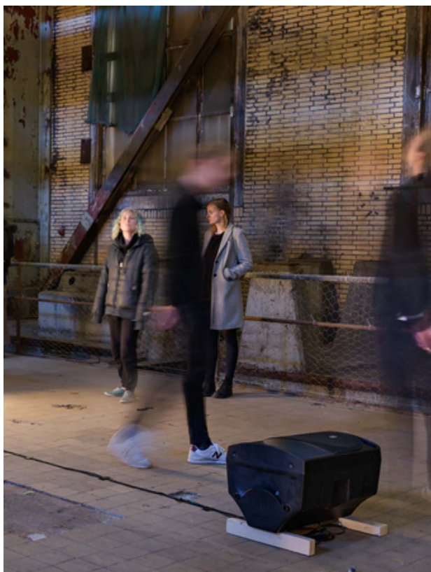
Untitled Frequencies II, 2019 Sound installation