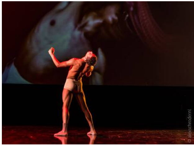
Harrison Bergeron , 2018 Projection