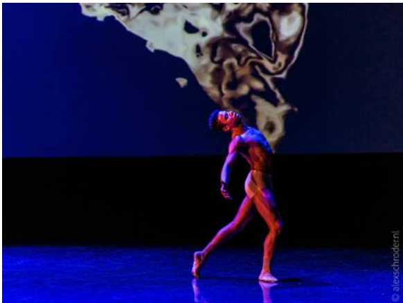
Harrison Bergeron , 2018 Projection