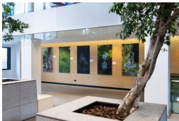
Ode aan de Oase, 2024