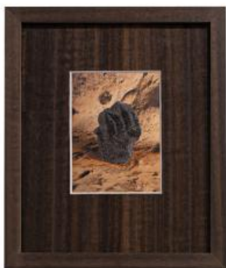
Carbon Fossil, 2024