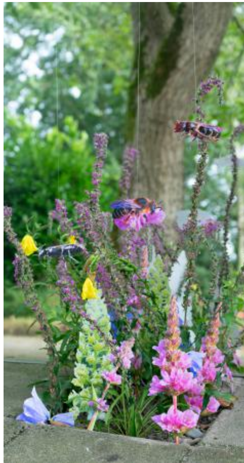
The Bee Garden, 2024