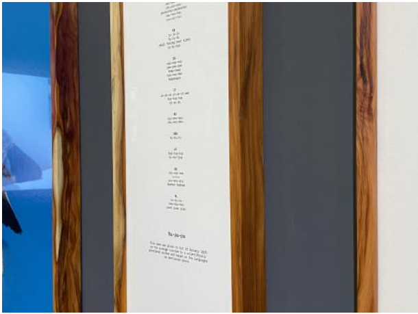
Upupa Epops, 2023