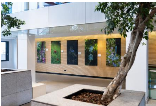
Ode aan de Oase, 2024