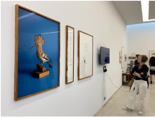
Upupa Epops, 2023