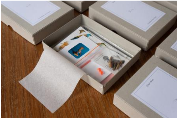
Upupa Epops Multiple, 2023