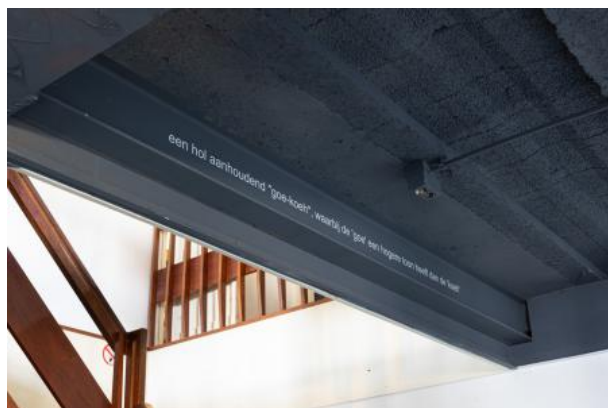
Noiseless, Soundless, 2023