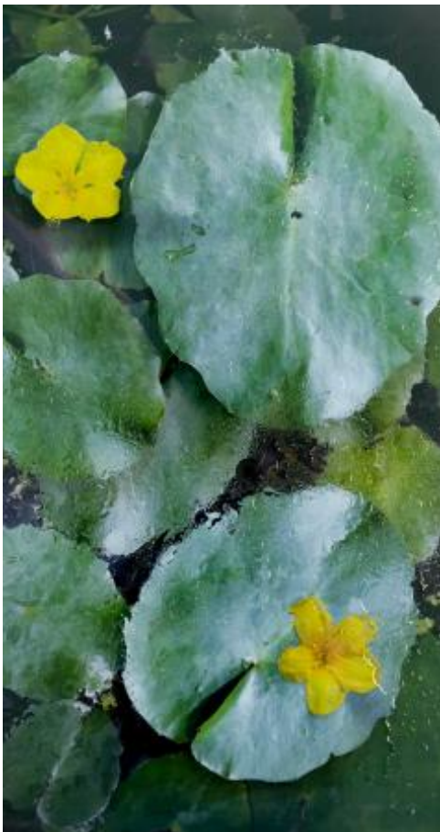
The Wadi, 2024