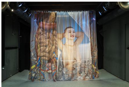
Ice Bath, 2021 Digital print on polyester, 535 x 350 cm