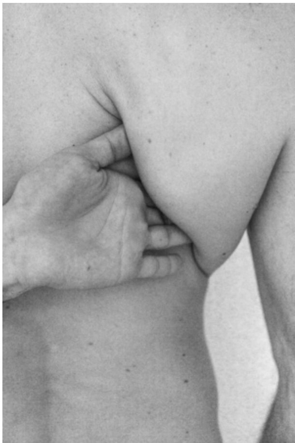
Under the Scapula, 2019 Pigment print mounted on dibond, 73 x 110 cm