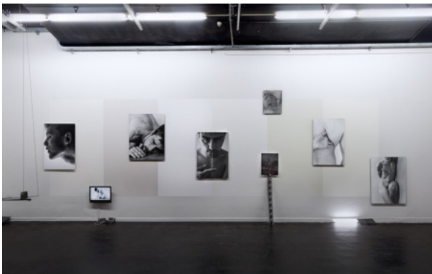
White Walls and Exercises in Freedom, 2019 Mixed media

2019 Stroom KABK Invest Award (sinds 2004) Stroom, Den Haag The Hague, Netherlands