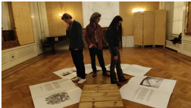
SOLO EXHIBITION CONTRARY TO WHAT WE THOUGHT SO FAR. PULCHRI STUDIO, THE HAGUE., 2022 Installation., Various.