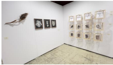
This Art Fair, 2025 Sculpture, performance., -