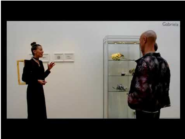
Exhibition Amethyst - Pulchri Studio, 2021