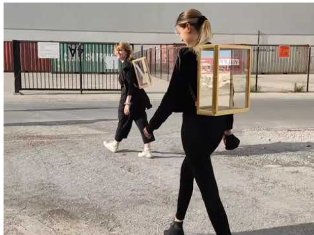
KONVOOI FESTIVAL - BRUGGE BELGIUM, 2021