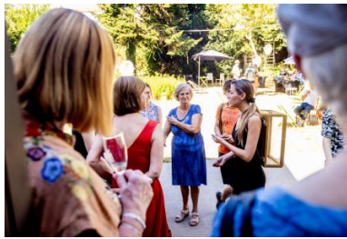
GROUP EXHIBITION PLUSSING. WARP. CONTEMPORARY ART SPACE. Sint Niklaas, Belgium. August/September 2022. , 2022 Sculpture/Performance, Variable.