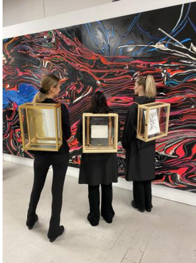
PERFORMANCE IN THE FRAME OF HOOGTIJ DEN HAAG., 2022 Performance., Variable.