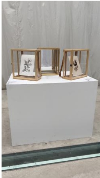
Womens house exhibition, 2025 Sculpture-Performance, Variabl