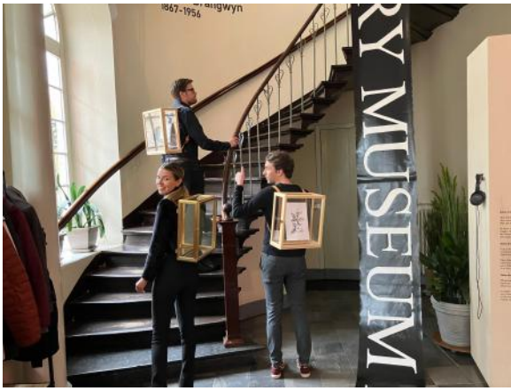
EXHIBITION BENCH-MARK April 2023. Arentshuis Museum. Bruges, Belgium., 2023 Various., Various.