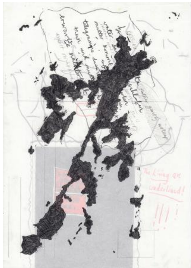
Father Gently Asleep (from the series Little Odes), 2023 Pencil on transparent paper, 210 x 297mm