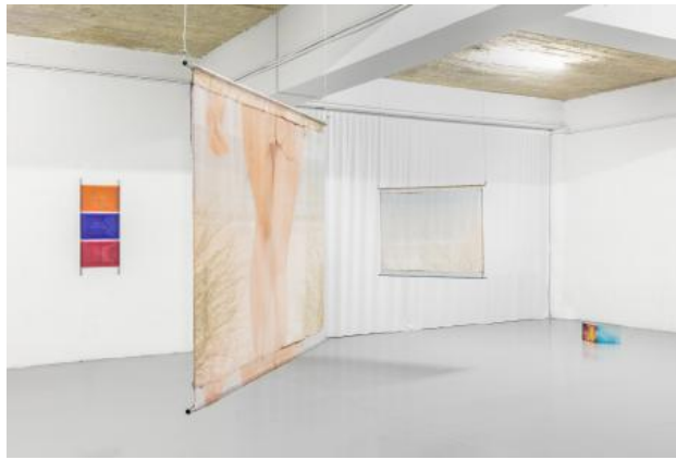
Single Framing: Second by Second, 2024 Double-sided sublimation printing onto transparent fabric, steel beams. UV printing onto acrylic, hinges, bolts. Scratched away laser printing onto acetate film, steel beams, magnets., Variable dimensions