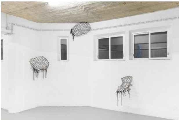
Single Framing: Second by Second, 2024 Knotted ribbon, copper, Variable dimensions