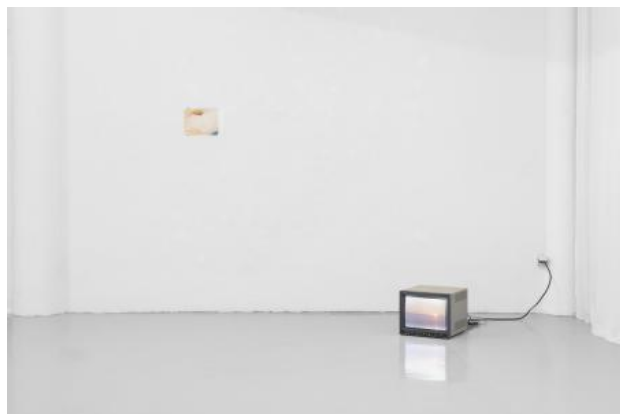
Single Framing: Second by Second, 2024 UV printing onto acrylic; TV, audio piece., Variable dimensions