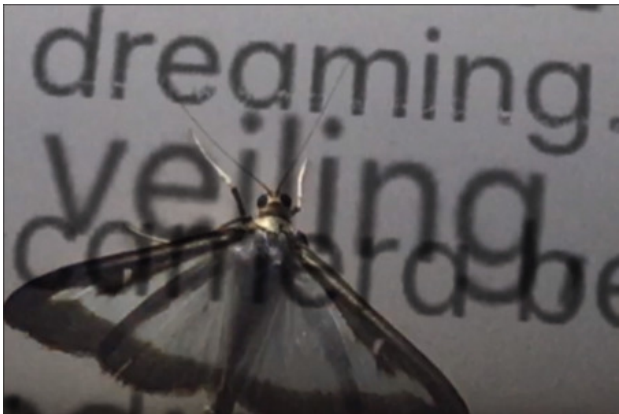
The Butterfly Dream, 2021 digital video & MiniDV, 640 x 960 pixels