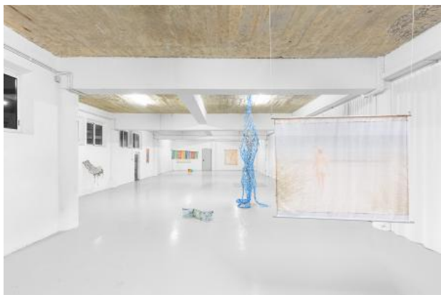
Single Framing: Second by Second, 2024 Double-sided sublimation printing onto transparent fabric, steel beams; UV printing onto acrylic, hinges, bolts; scratched away laser printing onto acetate film, steel beam, magnets; TV, audio piece; knotted ribbon, copper, wire. , Variable dimensions