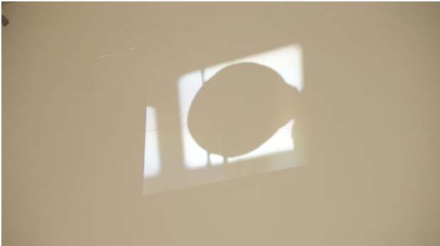
Moonbeams; to negotiate a better arrangement, 2020