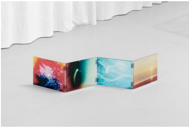
Single Framing: Second by Second, 2024 UV printing onto acrylic, hinges, bolts., Variable dimensions