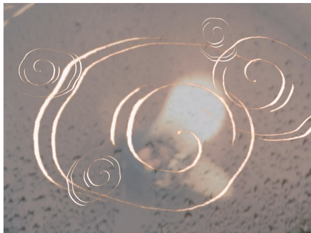
Inherited Pains (sketch for my gasping stomach), 2022 1 minute