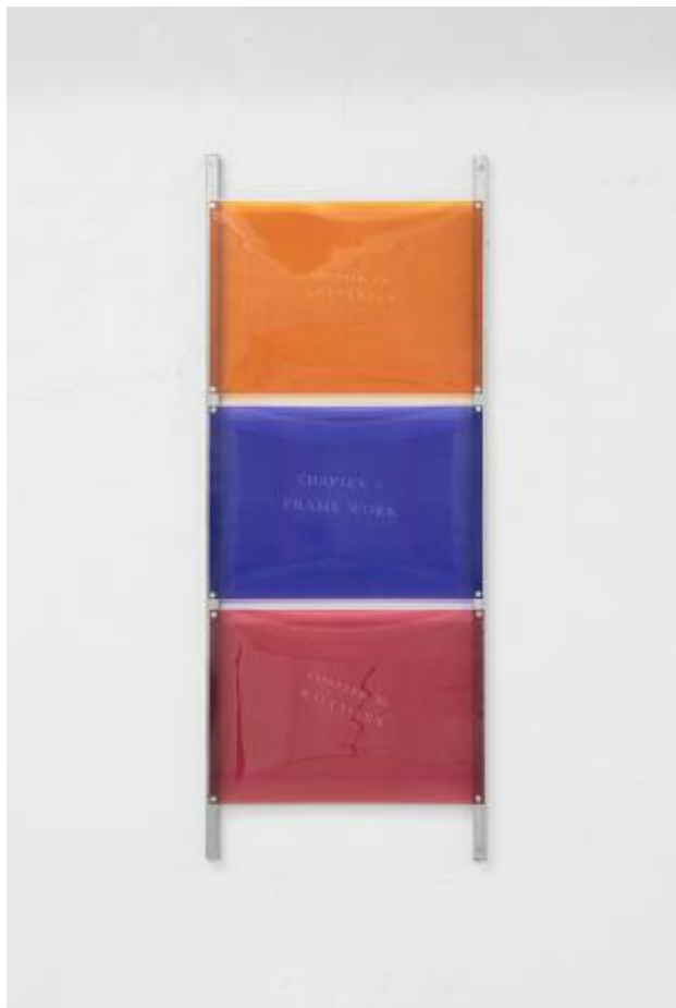
Single Framing: Second by Second, 2024 Scratched away laser printing on acetate, steel beam, magnets.