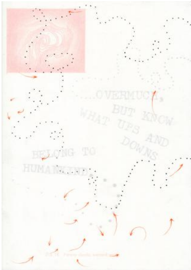
Undigested Shocks (from the series Little Odes), 2023 Pencil on transparent paper, 210 x 297mm