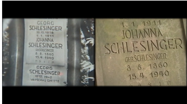
I've to Think Not Twice, but Twice Twice, 2022 3 minutes