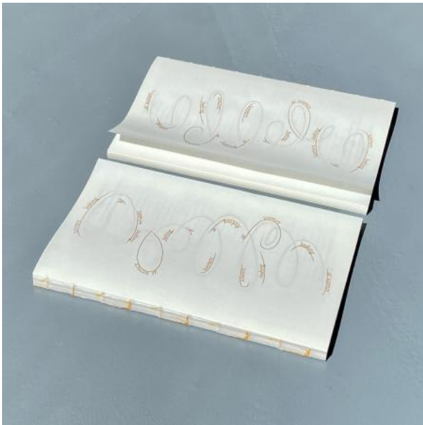
Women Looking at Women Looking at Women, 2022