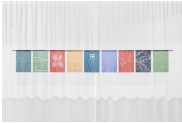
Single Framing: Second by Second, 2024 Scratched away laser printing on acetate, steel beam, magnets., 42 x 29.7cm.