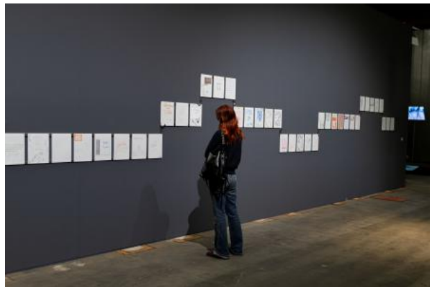
Little Odes, 2024 Graphite and coloured pencil on transparent paper, mild steel beams, custom aluminium magnets., 210 x 297 mm each