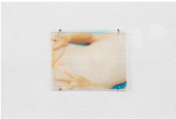
Single Framing: Second by Second, 2024 UV printing onto acrylic