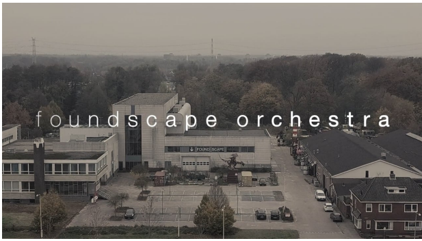
Foundscape Orchestra x Drukpershal Enschede, 2021 3:00