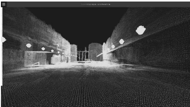
Foundscape - Virtual Drukpershal , 2022 1:08