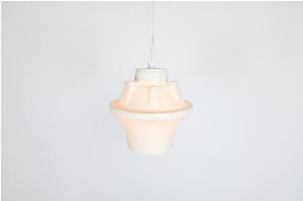
Soundshape I, 2018 Porcelain, electronics, 20 x 18 x 18 cm