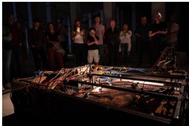
Ex-Piano (Foundscape Orchestra x Koelhuis Eindhoven), 2023 Piano, electronics, 150 x 180 x 80 cm