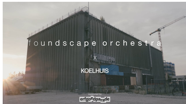
Foundscape Orchestra x Koelhuis Eindhoven, 2023 3:22