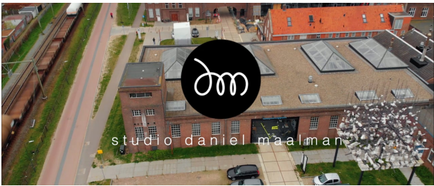
Foundscape Orchestra x EKWC, 2020 1:58