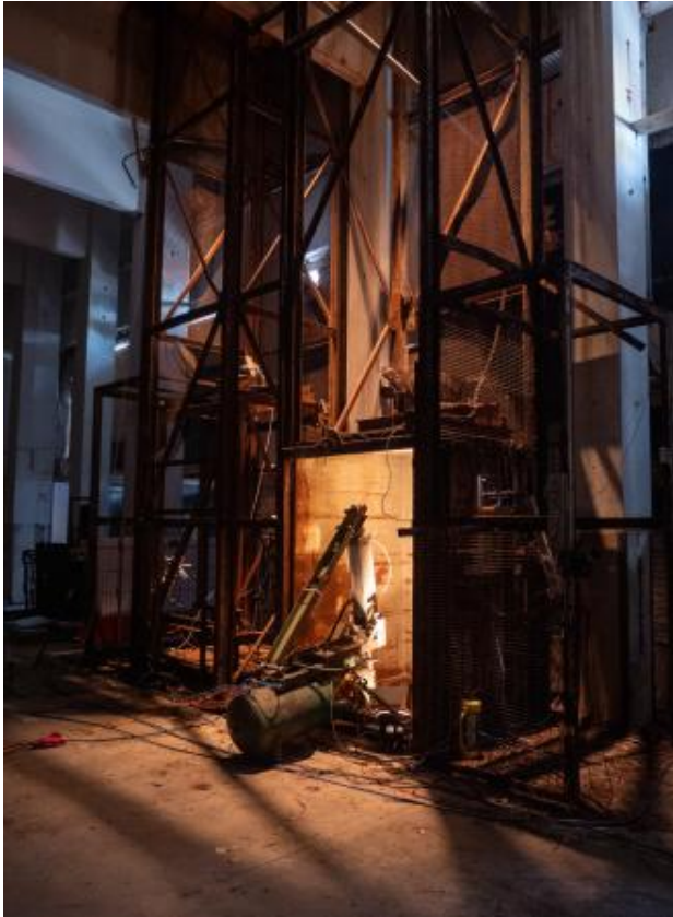
10BAR (Foundscape Orchestra x Koelhuis Eindhoven), 2023 Steel, linear actuator, electronics, 140 x 200 x 80 cm