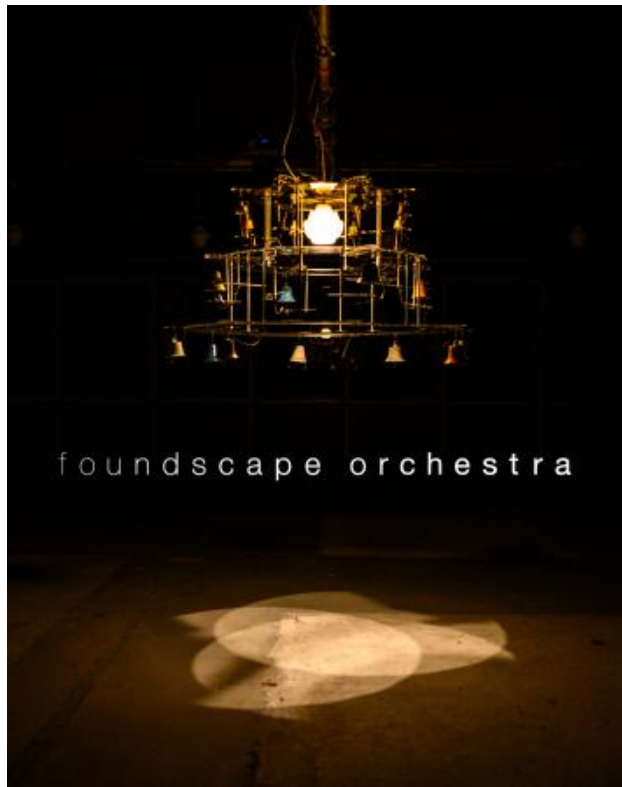
Foundscape Orchestra - 21TET1 , 2021 Keramiek, kunststof, electronica, 120 x 120 x 120 cm