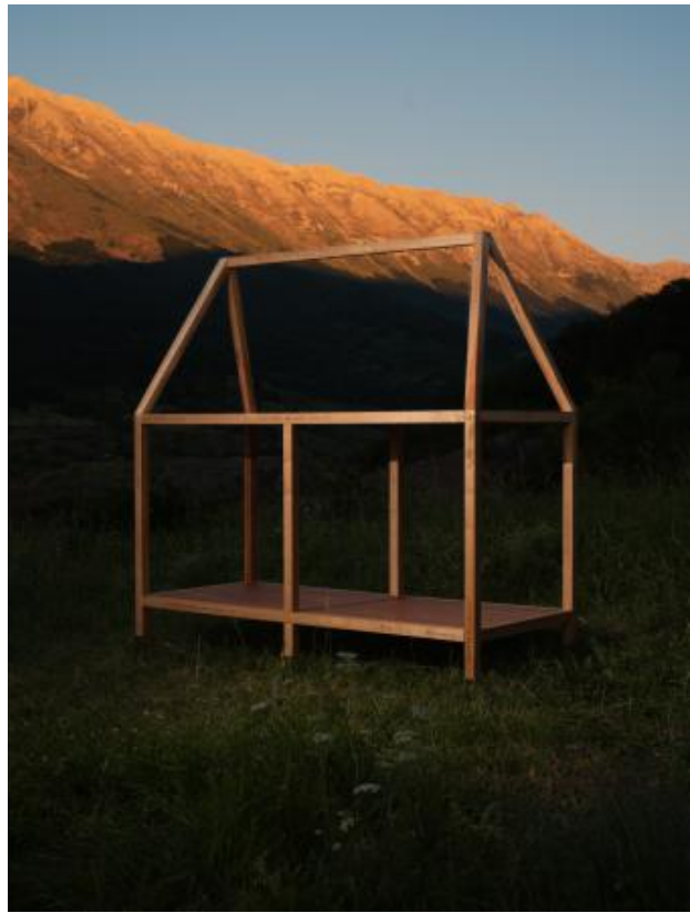
Letto parlante 2, 2025 engraved ash wood, 200 x 90 x 190 cm