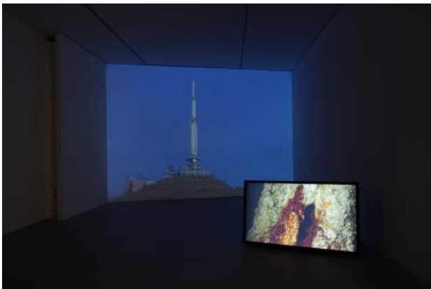
Tin Cry , 2025 7', super 16mm transferred in 2K, 2 channels on loop,