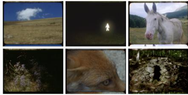
l'infestata, 2026 11', super 16mm transferred in 2K, sound