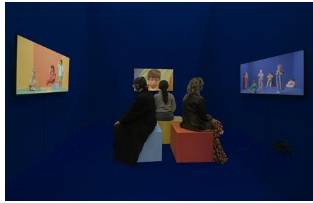
Lose Voice Toolkit, 2024 three channel installation, 5'30", 6'00", 5'15", super 16mm transferred in 2K, 350x350x400cm