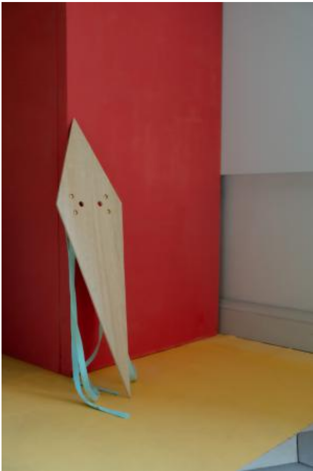
Lose Voice Toolkit, 2024 18'30", super 16mm transferred in 2K, projection, film set, props, costumes,, variable dimensions