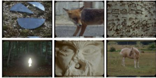
l'infestata, 2026 11', super 16mm transferred in 2K, sound