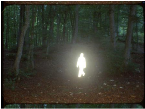
l'infestata, 2026 11', super 16mm transferred in 2K, sound