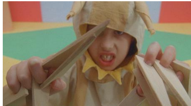
Lose Voice Toolkit (video still), 2024 super 16mm transferred in 2K, , 18'30"