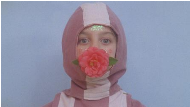
Lose Voice Toolkit (video still), 2024 super 16mm transferred in 2K, , 18'30"