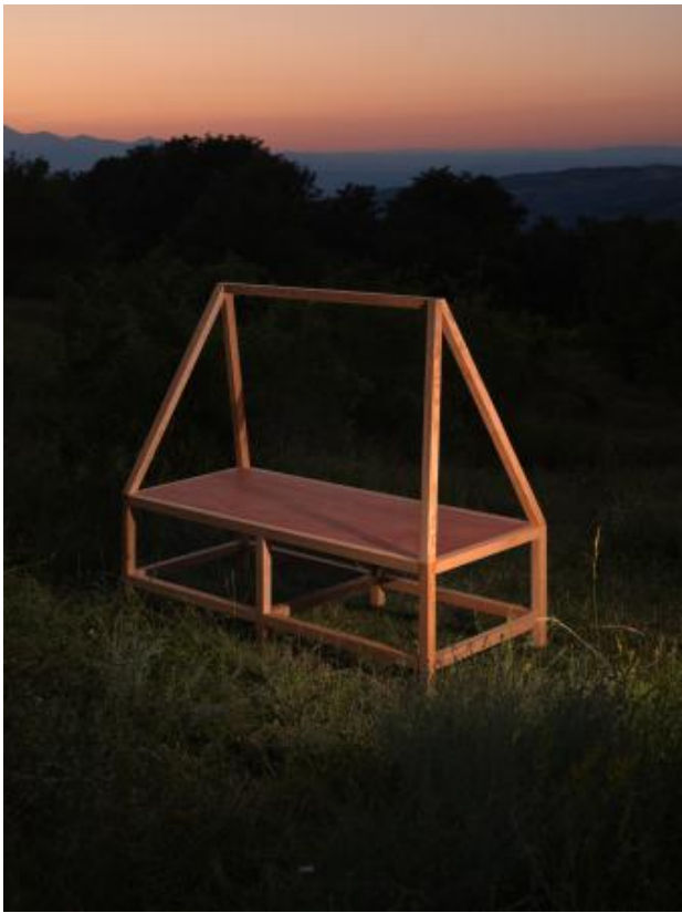
Letto parlante 3, 2025 engraved ash wood, 200 x 90 x 160 cm