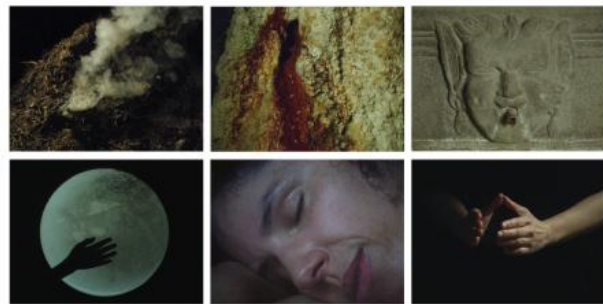
Tin Cry, 2025 7', super 16mm transferred in 2K, 2 channels on loop,