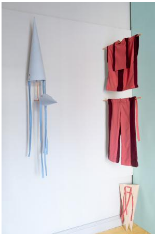
Lose Voice Toolkit, 2024 18'30", super 16mm transferred in 2K, projection, film set, props, costumes,, variable dimensions