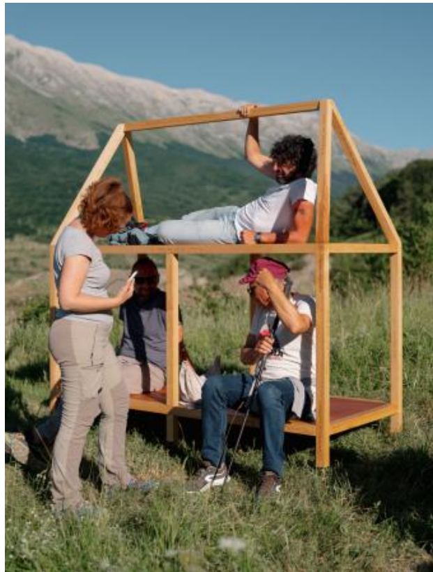
Letto parlante 2, 2025 engraved ash wood, 200 x 90 x 190 cm