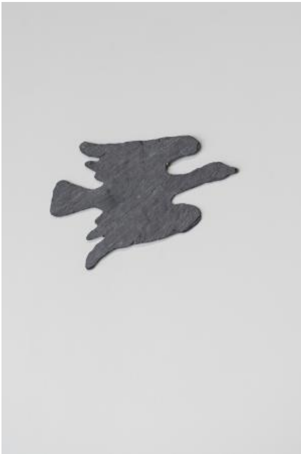
Cipì, 2025 slate roof tiles, 30x40 cm