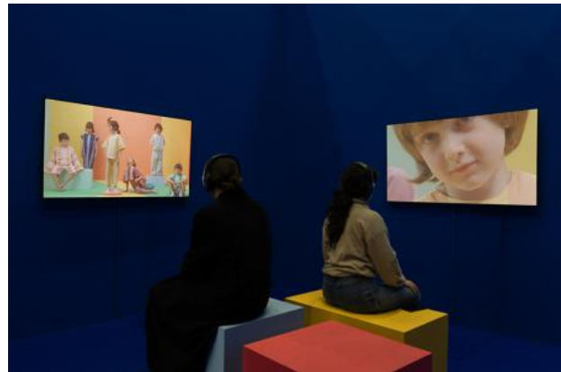
Lose Voice Toolkit, 2024 three channel installation, 5'30", 6'00", 5'15", super 16mm transferred in 2K, 350x350x400cm