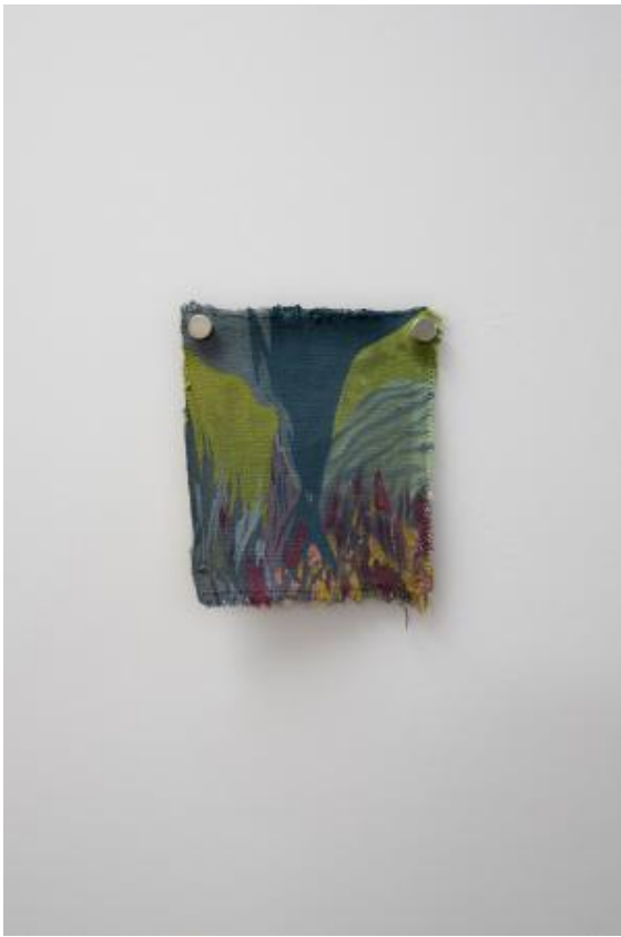
Reading Slippages (a small painting series), 2024 Gouache on canvas