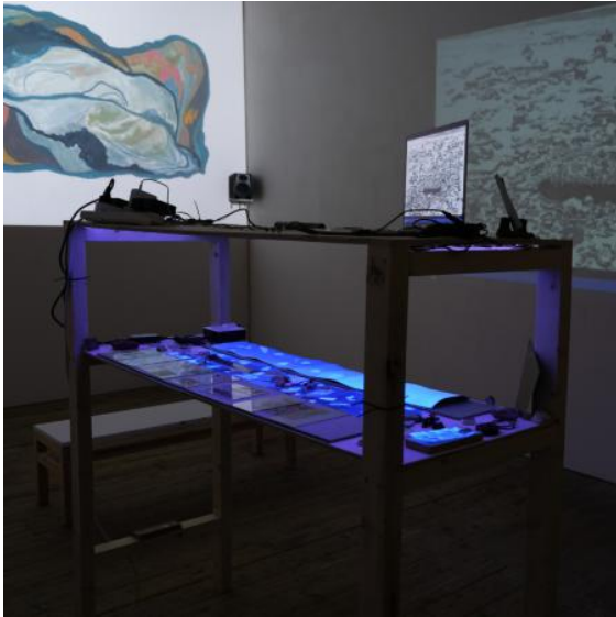
Reading Slippages, Writing Interstices, 2023