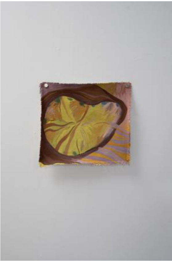
Reading Slippages (a small painting series), 2024 Gouache on canvas