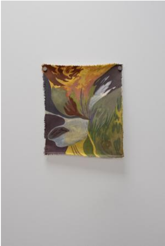
Reading Slippages (a small painting series), 2024 Gouache on canvas