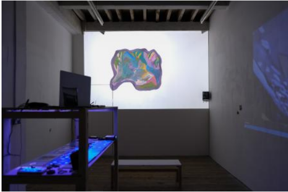
Reading Slippages, Writing Interstices, 2023