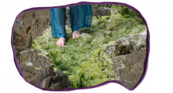
Reading Slippages, 2024 Animation Still