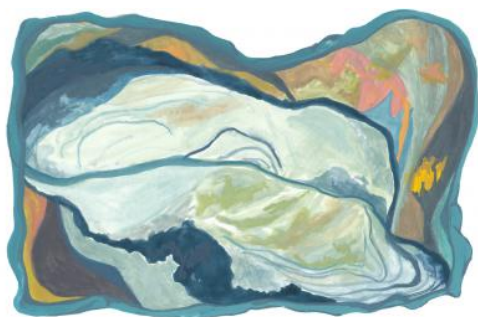
Reading Slippages, 2023 Watercolour on paper