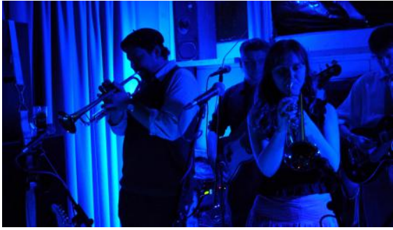
Reading Slippages (Live), 2024 Performance